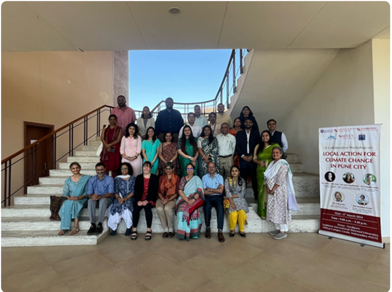
Local Action for Climate Change in Pune City - A Symbiosis International University Initiative