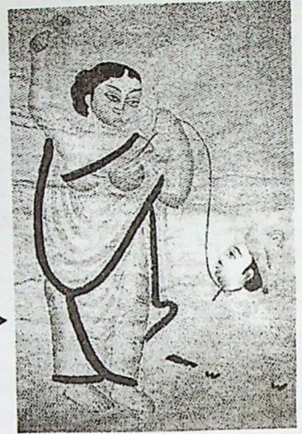
◀ Three Kalighat Pat Paintings ▶