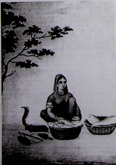
Two Paintings of Patna School ▶