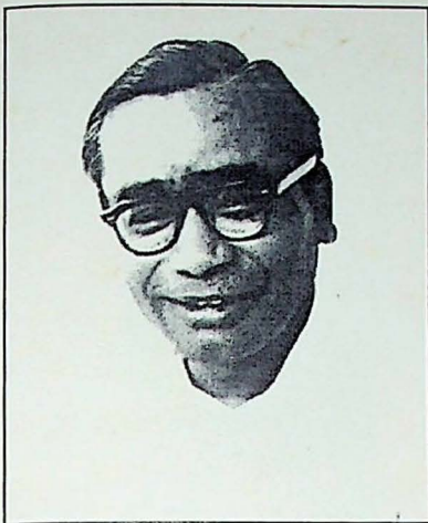
Dr. Rammanohar Lohia