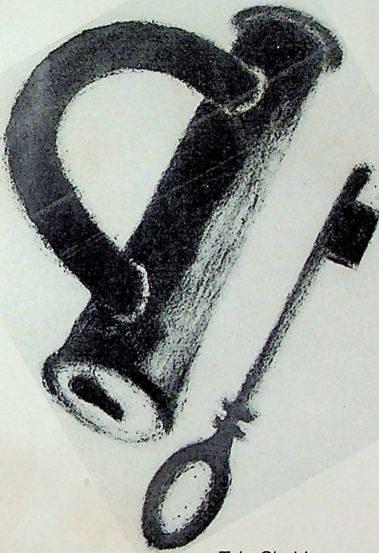
Tala-Chabi by Devilal Patidar

Tala-Chabi (Lock and Key) are symbols of Private Property. No one needs a Tala-Chabi , if there is no private property to which exclusive access is not to be claimed!