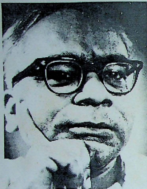
Dr. Ram Manohar Lohia b. 23. 3. 1910 - d. 12. 10. 1967