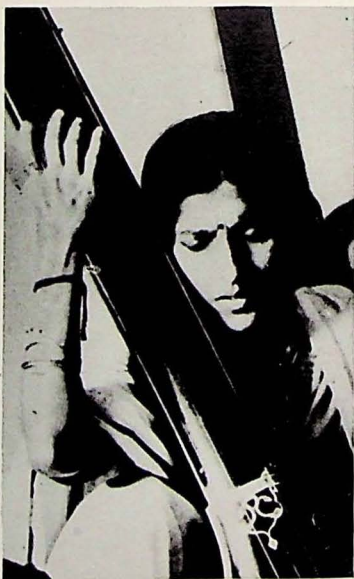
Kishori Amonkar b., 1931 Jaipur - Atrauli Gharana