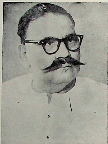
Bade Gulam Alikhan, 1902—1968 Patiala Gharana