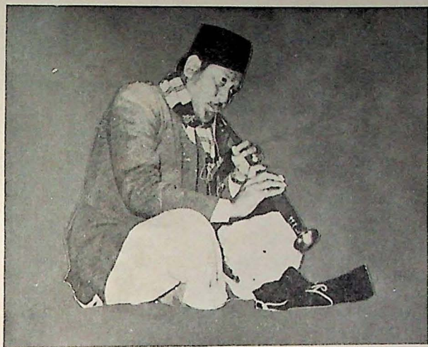
Bismillah Khan, b. 1908 Benaras Baaj