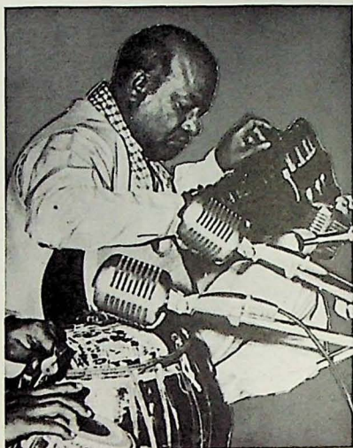
Ali Akbar Khan, b. 1922 Maihar - Allaudin Khan Baaj