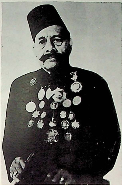
Faiyyaz Khan 1886—1950, Agra Gharana