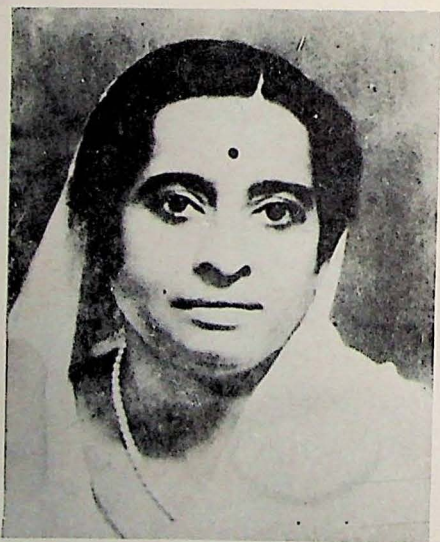
Kesarbai Kerkar, 1892—1977 Jaipur - Atrauli Gharana