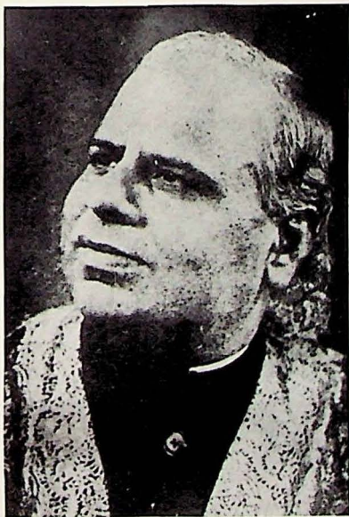
Omkarnath Thakur, 1897—1967 Gwalior Gharana