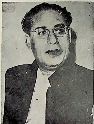
Amir Khan, 1912—1974 Indore (Mixed Kirana) Gharana