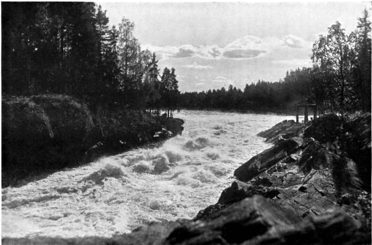
The Imatra Rapids.