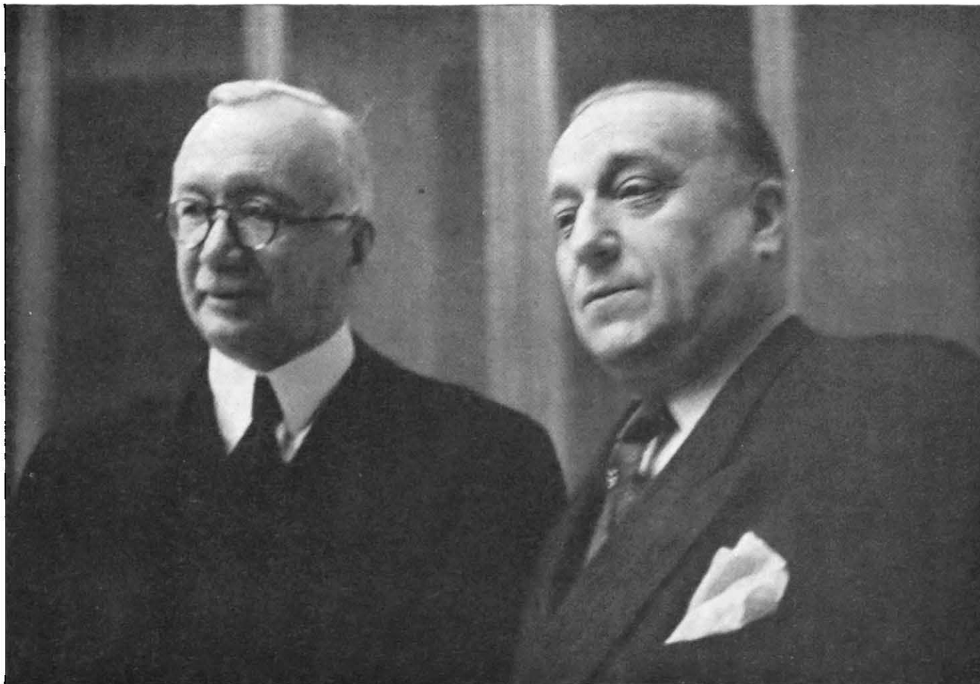
M. RUDOLF HOLSTI, Permanent Delegate of Finland to the League of Nations.