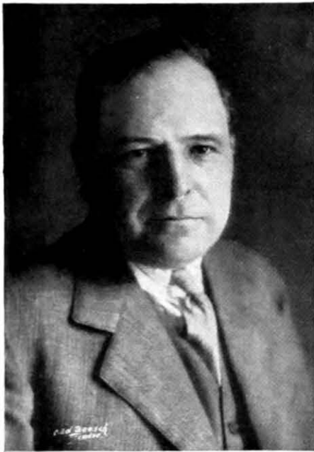
The President of the Twentieth session of the Assembly: M. C. J. Hambro, Delegate of Norway.

The Assembly considered the Special Committee's report at its meeting of December 14th.