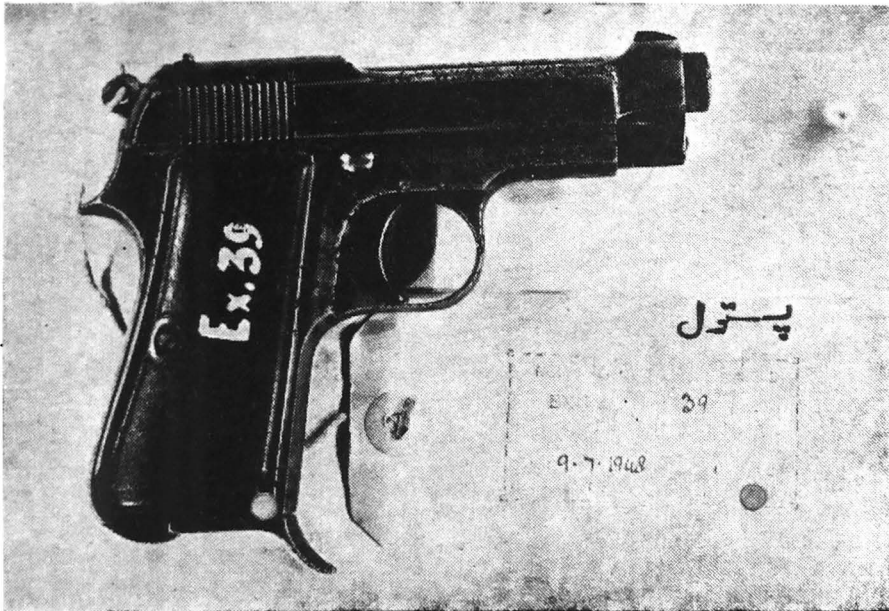
(i) Ex. 270 A—Pistol used by assassin Nathuram Godse. [Para. No. 5.11]