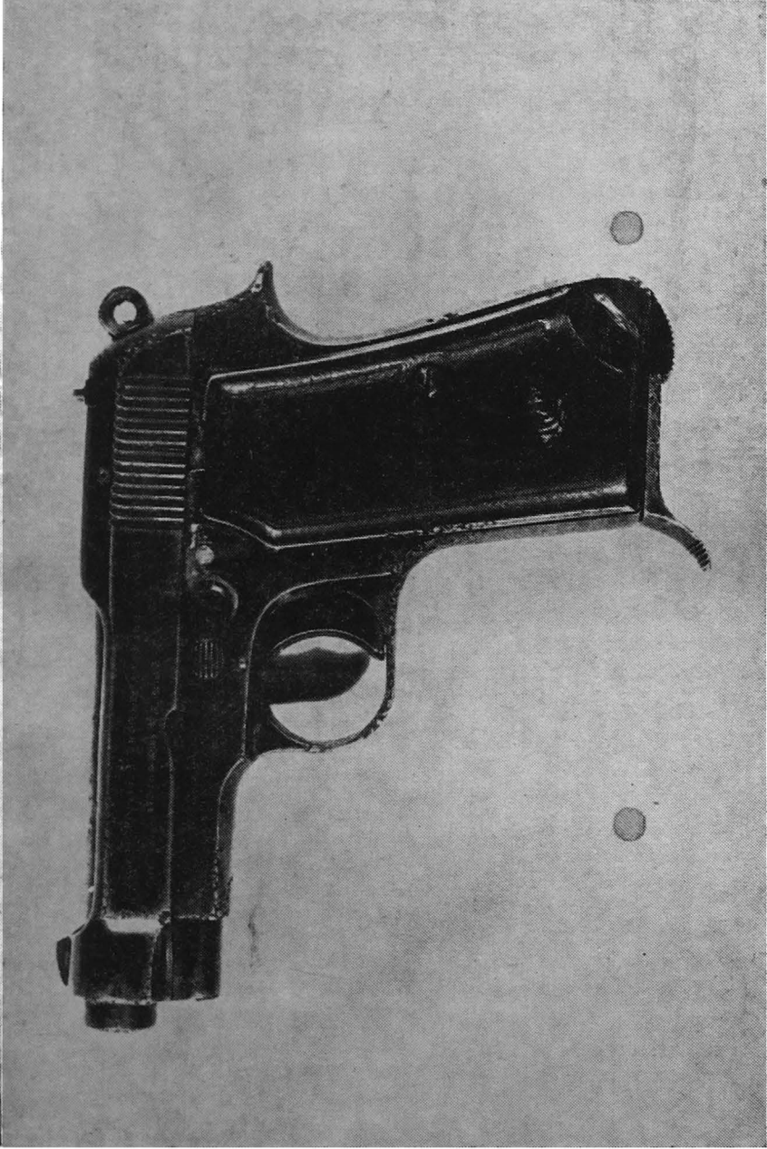
Ex. 270 C—Photo of the pistol. (Para. No. 2.30)