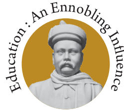
Gopal Krishna Gokhale

Agro-Economic Research Centre Gokhale Institute of Politics and Economics (Deemed to be University) Pune-411004