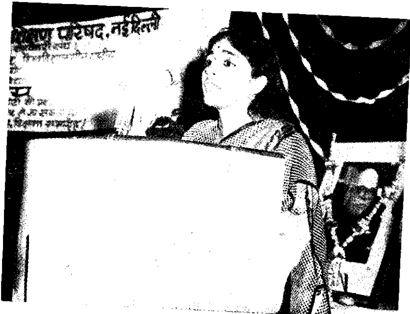
Debate in Action.