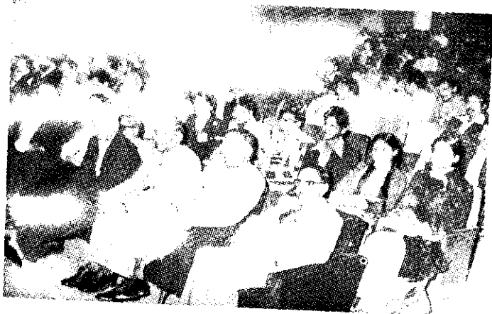
A view of the Audience.