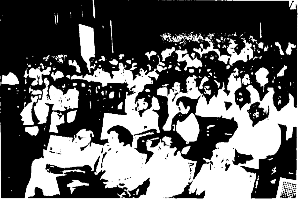
A view of the Audience.