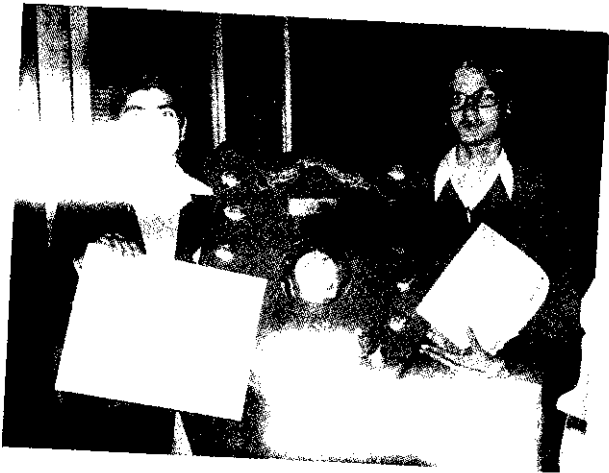
Winning Team of Delhi University in the Hindi National Debate.