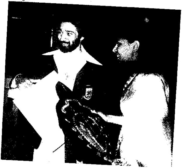
Winning Team of Karnataka University in English language National Debate.