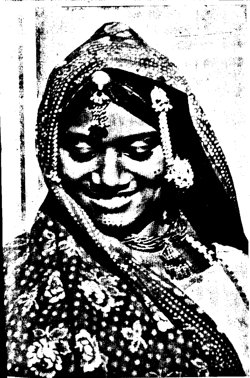
A BHIL GIRL

with the Scheduled Tribes & Scheduled Areas Conference held at New Delhi in June 1952