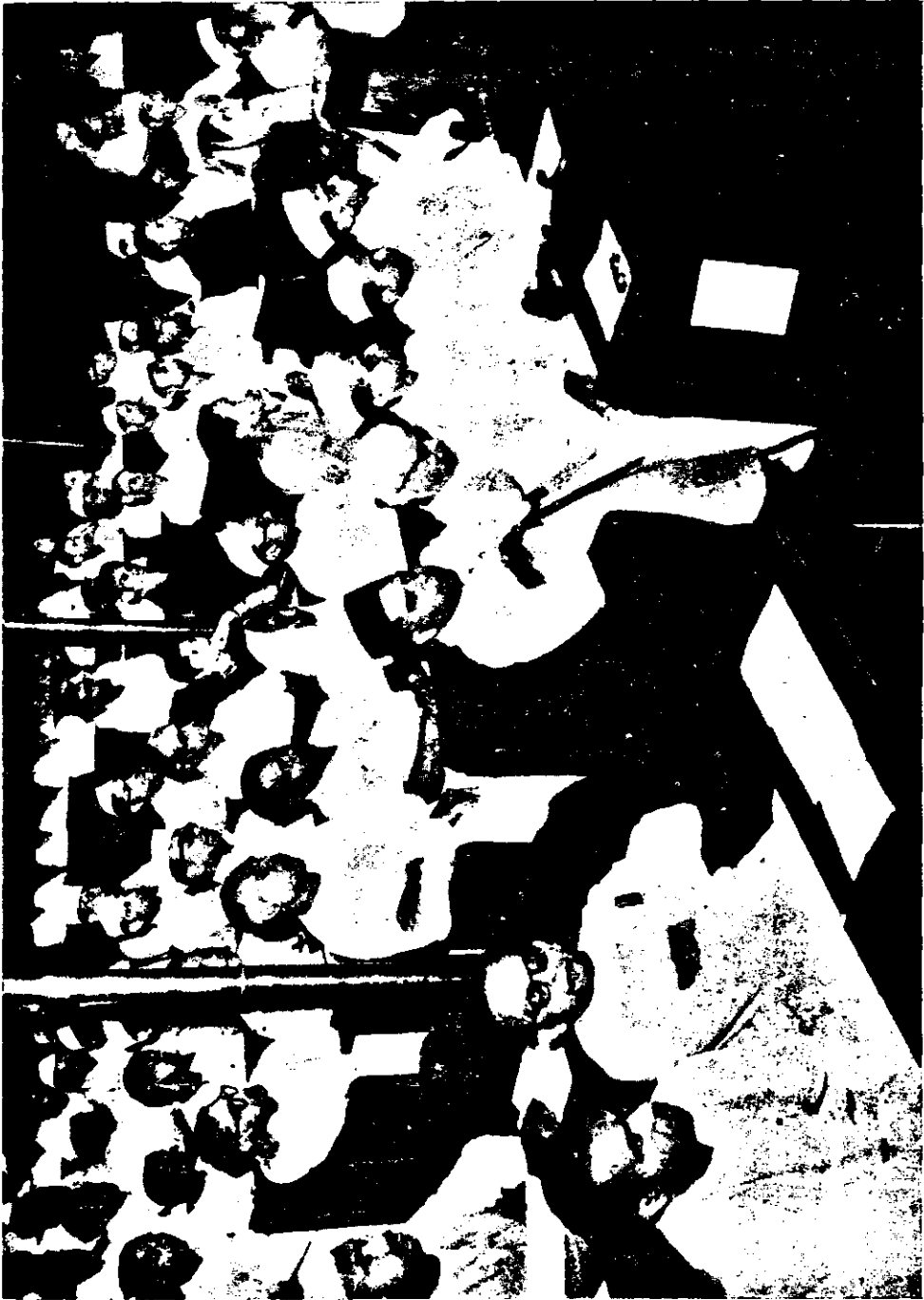
A section of the audience in the Conference Hall listening to the inauguration speech by the President, Dr. Rajendra Prasad.