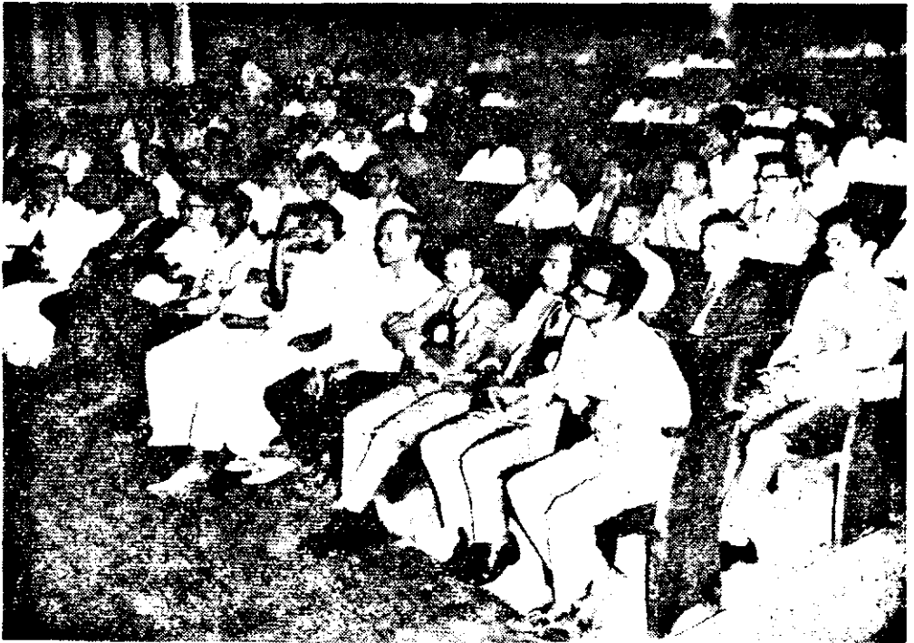
A view of Audience.