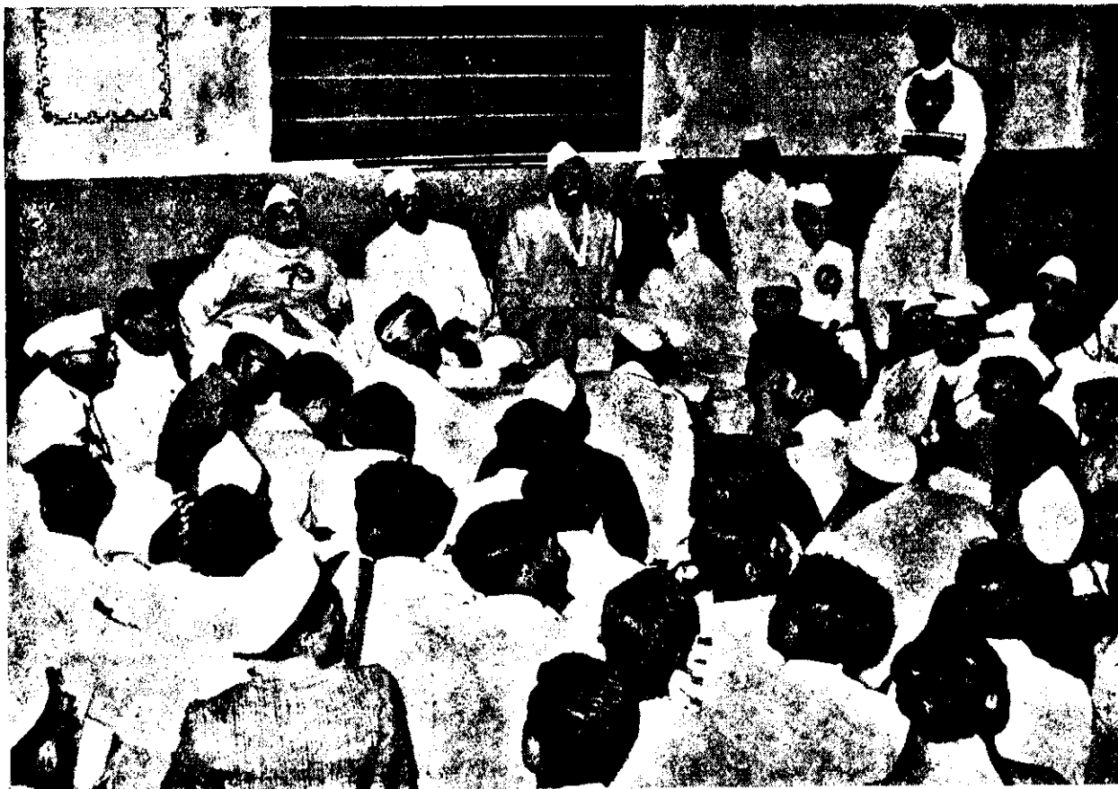
At the Worker's Meeting. आदिमजाति कार्यकर्ताओं के बीच नेता-गण