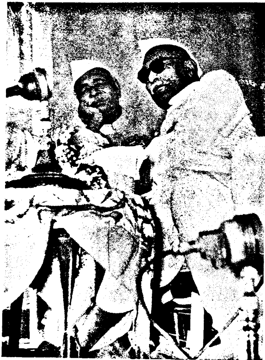
Dr. Rajendra Prasad and Shri Govind Ballabh Pant on the Dais. राष्ट्रपति डॉ० राजेन्द्रप्रसाद और गृहमन्त्री श्री पन्त बी खुले अधिवेशन में मंच पर