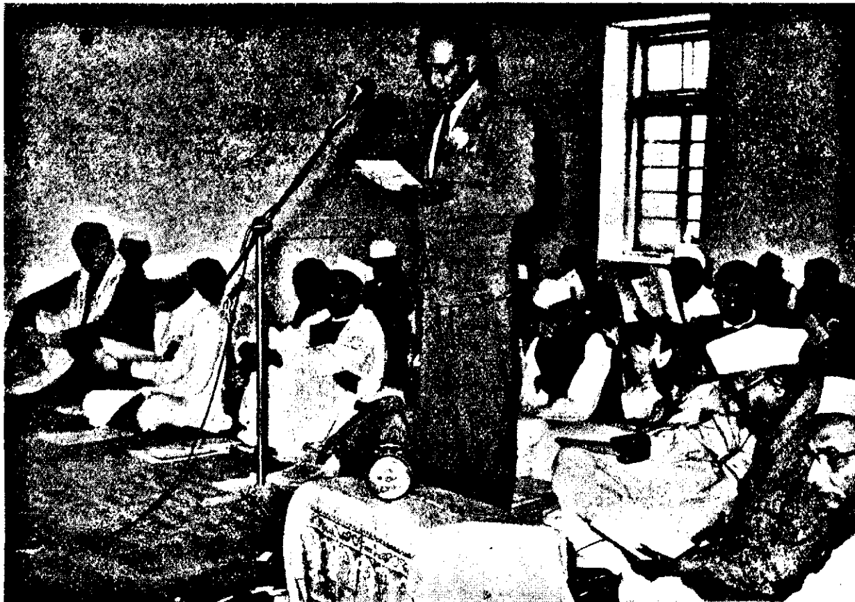
Shri Williamson Sangma delivering his address at the open Session.

श्री विलियमसन संगमा खुले अधिवेशन में अपना भाषण पढ़ रहे हैं