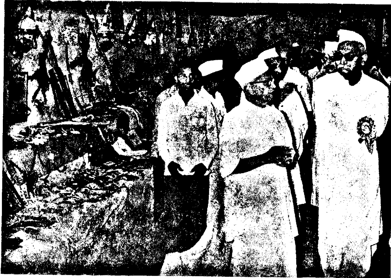
Dr. Rajendra Prasad going round the Exhibition.

डॉ० राजेन्द्र प्रसाद प्रदर्शनी को देखते हुए