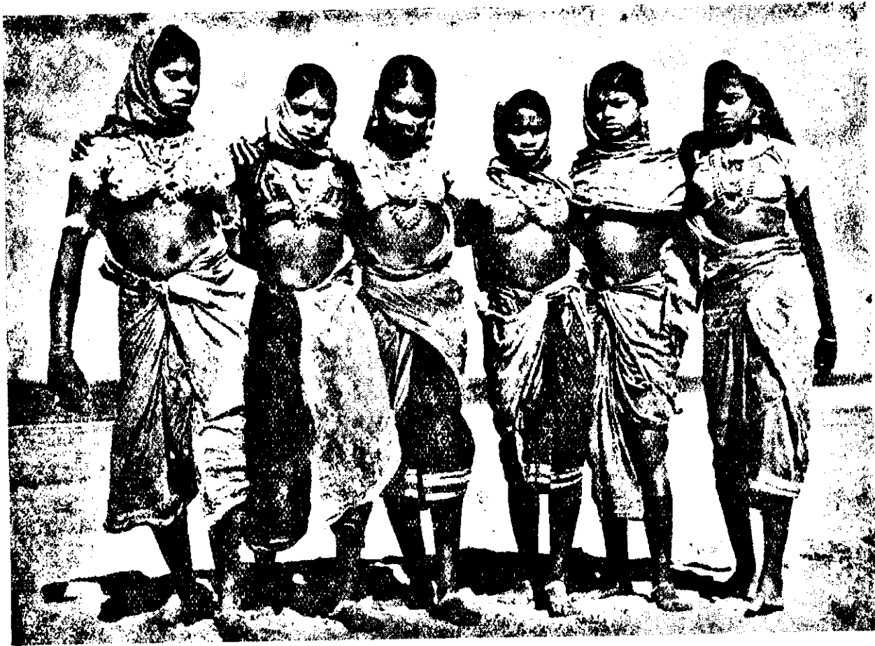
A view of Tribal Dance. आदिवासी नृत्य का एक दृश्य