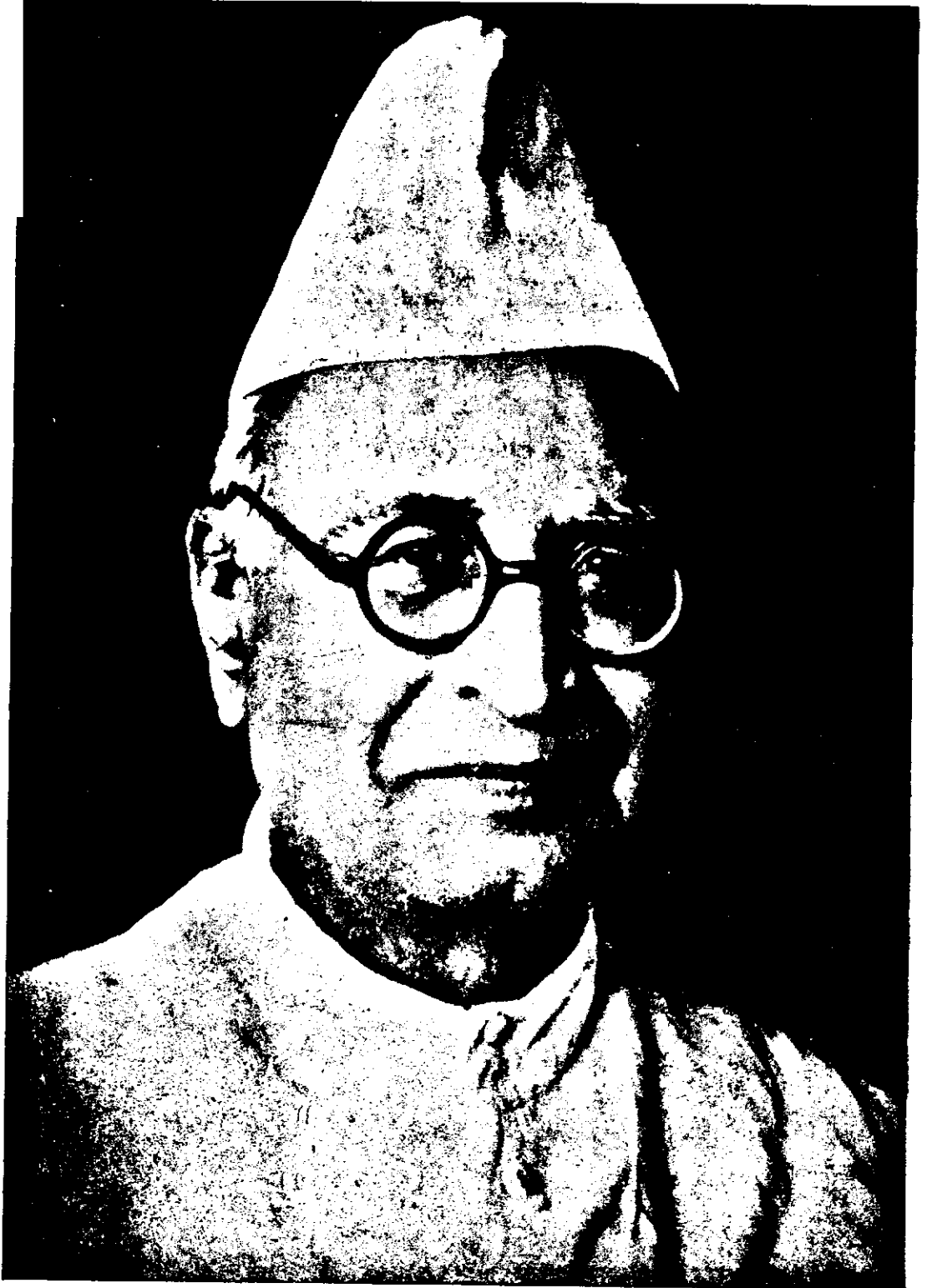
LATE SHRI THAKKAR BAPA