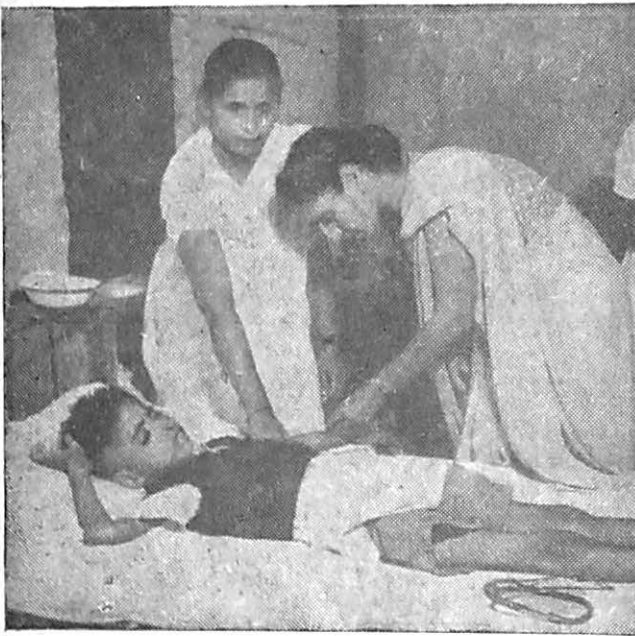
A patient is being examined by an experienced doctor at one of the relief camps

important positions in Pakistan, had grown into the habit of depending on the Government for the satisfaction of even their smallest wants. With a view to teaching them self-reliance and thus helping them to discard their habit of depending on Government aid and inducing them to take an active part in social and economic life of the State, elected sub-committees of displaced persons were set up to advise the Camp Officers in their welfare and rehabilitation work. An Advisory Council for every camp, consisting of elected members and some social workers of the locality who took interest in the problem of displaced persons, was also appointed.