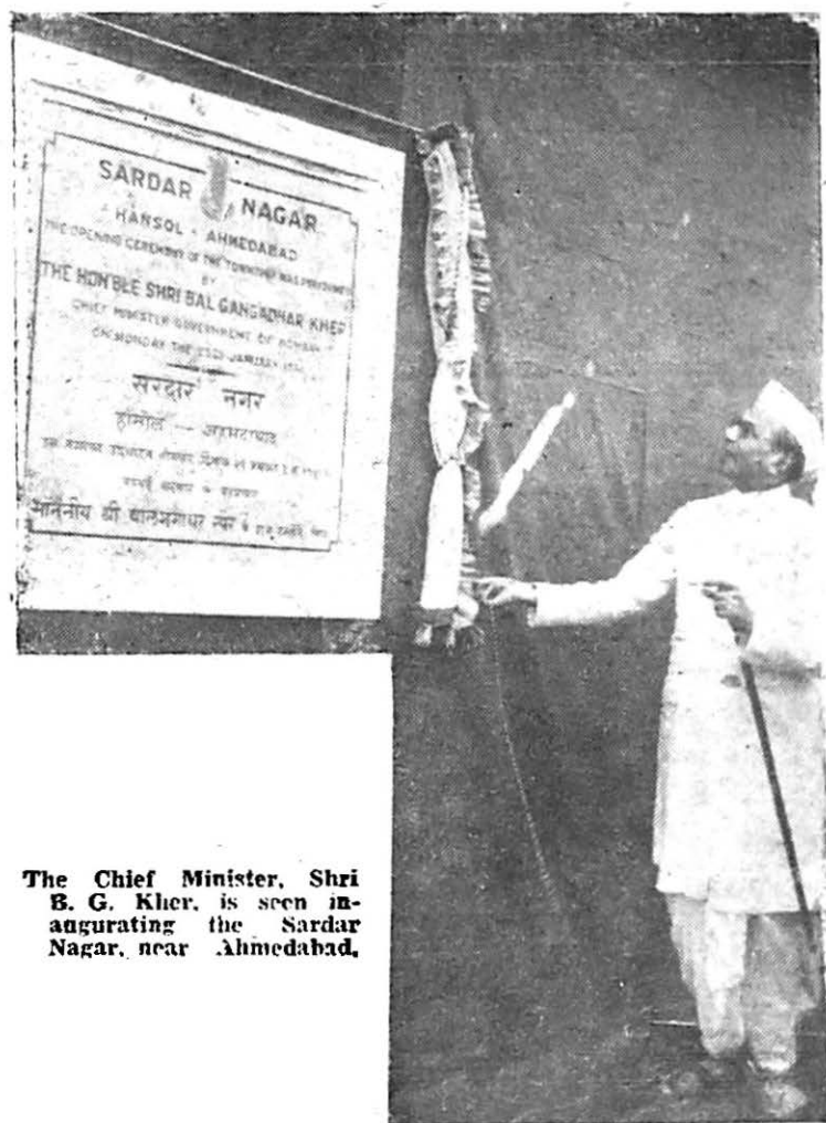
The Chief Minister, Shri B. G. Kher, is seen inaugurating the Sardar Nagar, near Ahmedabad.