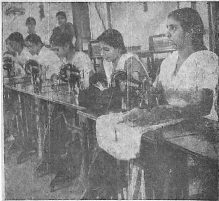
A view of the tailoring class at the Nari Seva Sadan.

The Satya Jeewan Co-operative Dairy Society in Kalyan Camp was registered in 1949, with 12 members who are displaced persons and a share capital of Rs. 1,511. The society intends to establish a small dairy by keeping about 25 buffaloes.