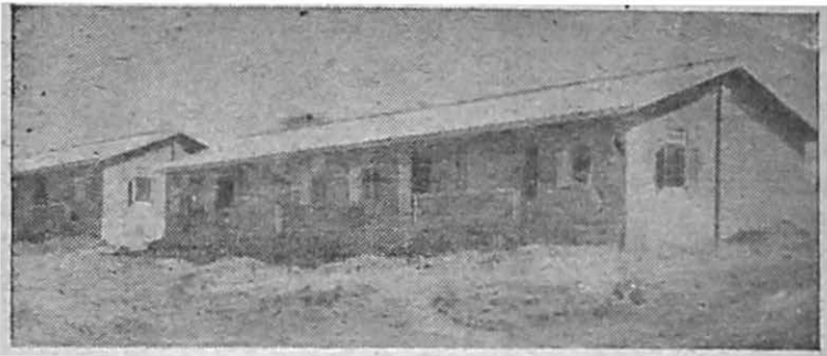
A three-room tenement at Ulhasnagar.

The rate of interest will be 3\frac{1}{2} per cent in all cases.