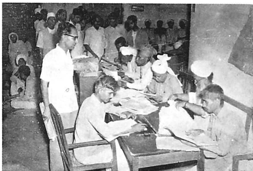
Hearing of complaints in the office of the Chief Claims Commissioner.