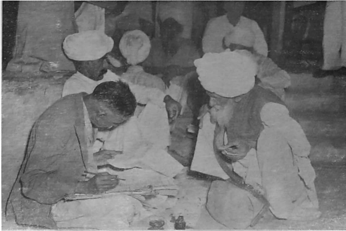
A claimant getting petition prepared by a professional petition writer.