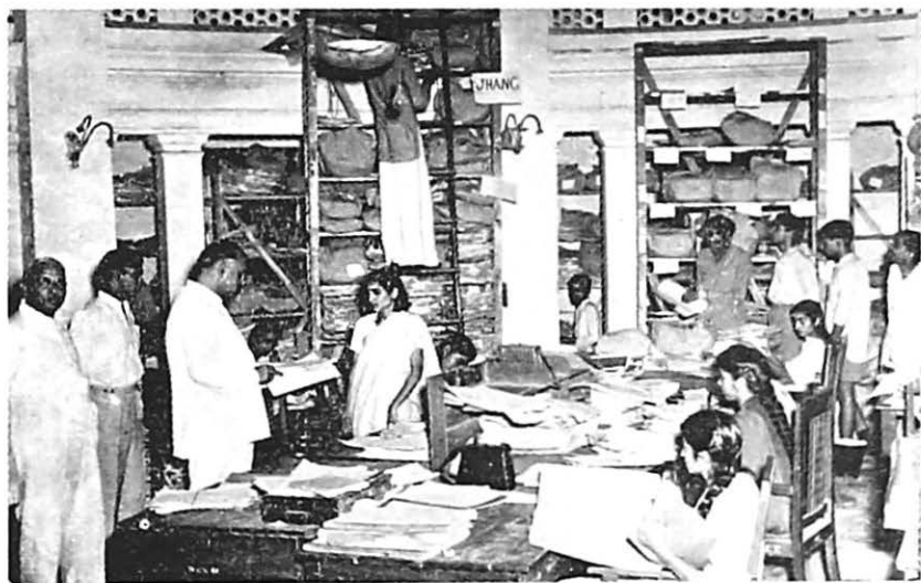
A portion of the Record Room of the office of the Chief Claims Commissioner.