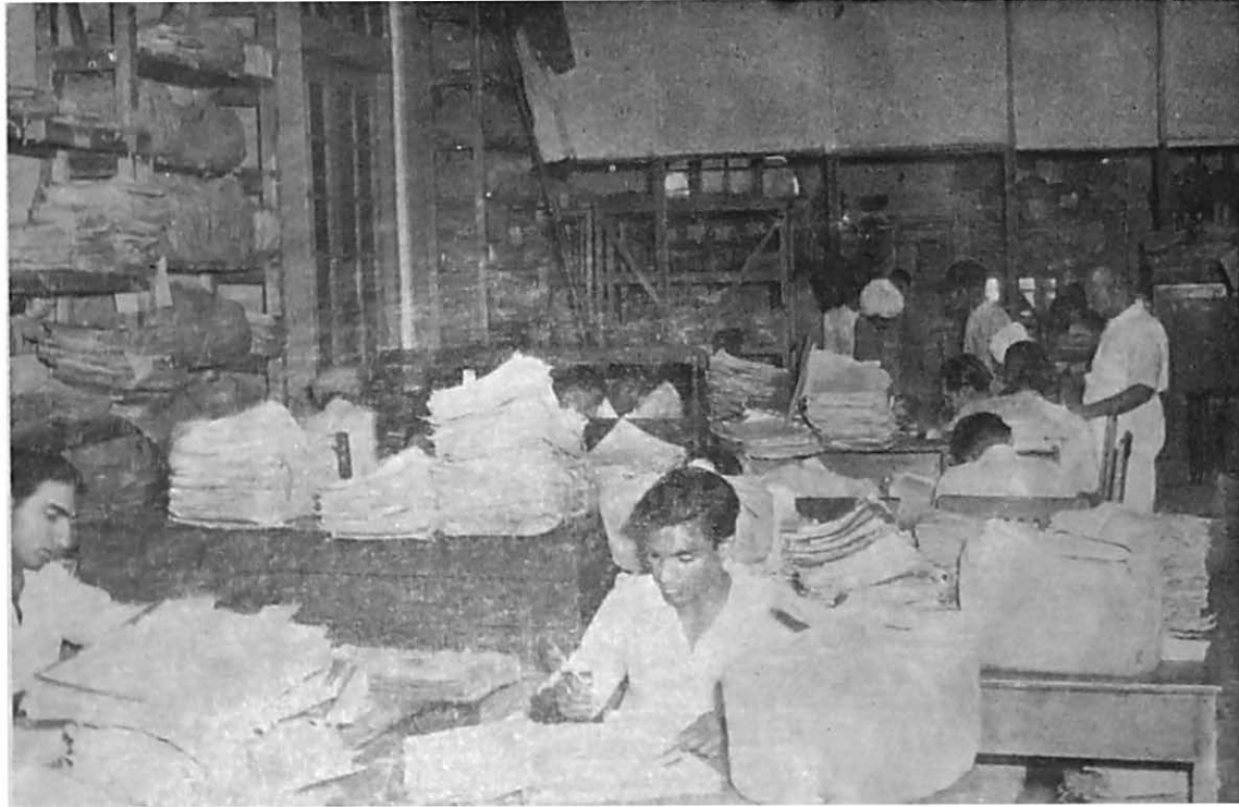
Record Room in the office of the Chief Claims Commissioner where verified claims of displaced persons were kept,