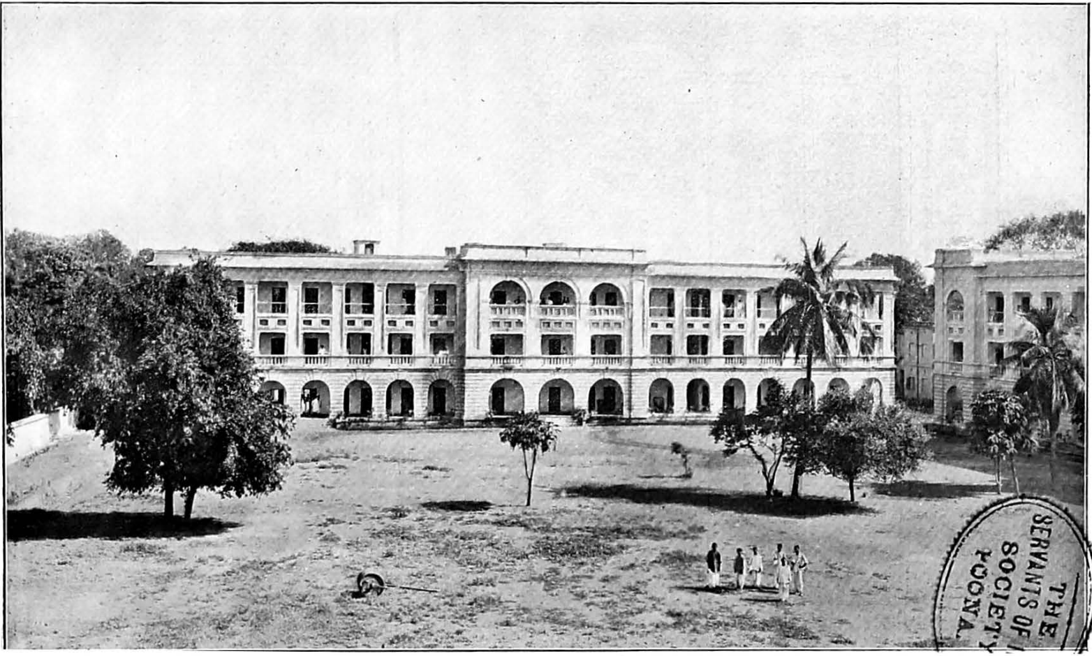
BIHAR NATIONAL COLLEGE THREE-STORIED HOSTEL