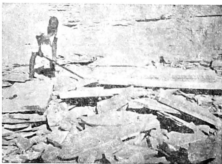
Large and thick slabs moved by crowbars.