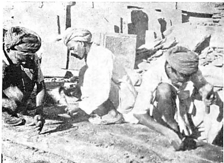
Method of cutting limestone slabs.