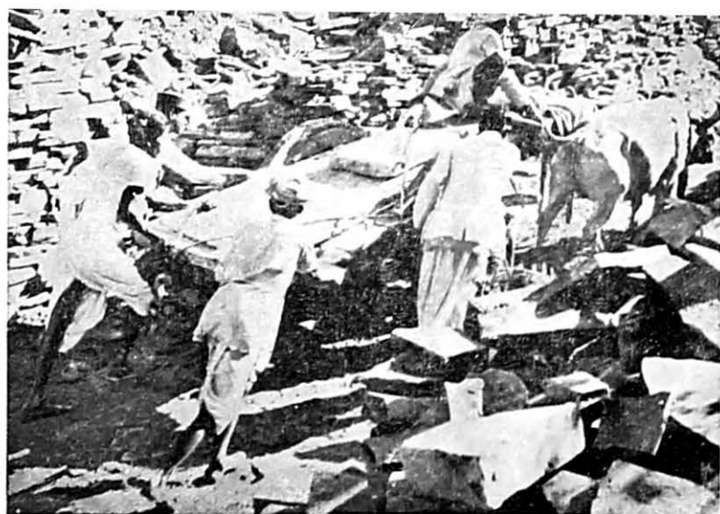
Carting limestone from the quarry.