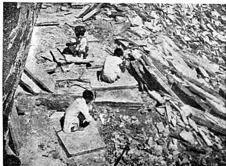
Separating cut slabs from a quarry.