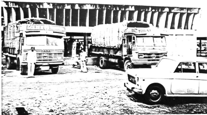
Chhatrapati Shivaji Wholesale Market yard at Gultekadi, Pune.