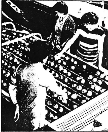
Electronic fruit-sorting system.

This new product makes it easy to program as well as to control production more effectively. Overloading of collateral conveyors can be avoided, as the spoiled fruit is rejected. In addition, the MAF system automatically sorts the fruit according to its final destination. Once again, this helps to prevent overloading the exits from the conveyor. The bottom line shows a decided, net improvement in the quality of a grower's fruit.