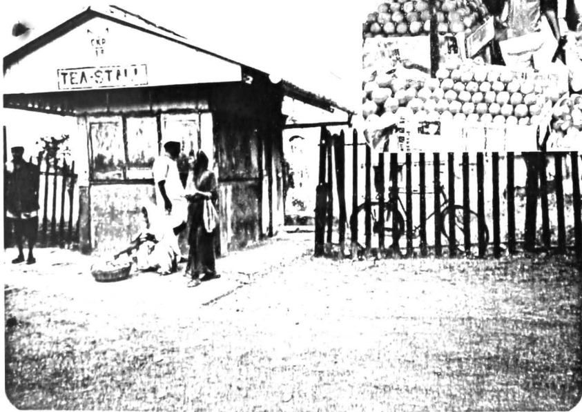
Female hawker selling bananas