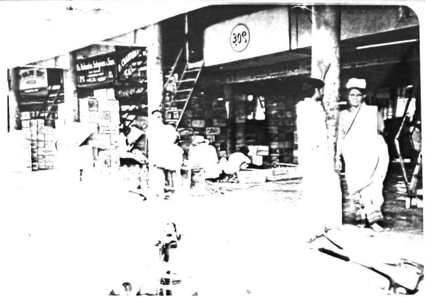
Wholesale Marketing of Fruit at the Gultekadi Market Yard.