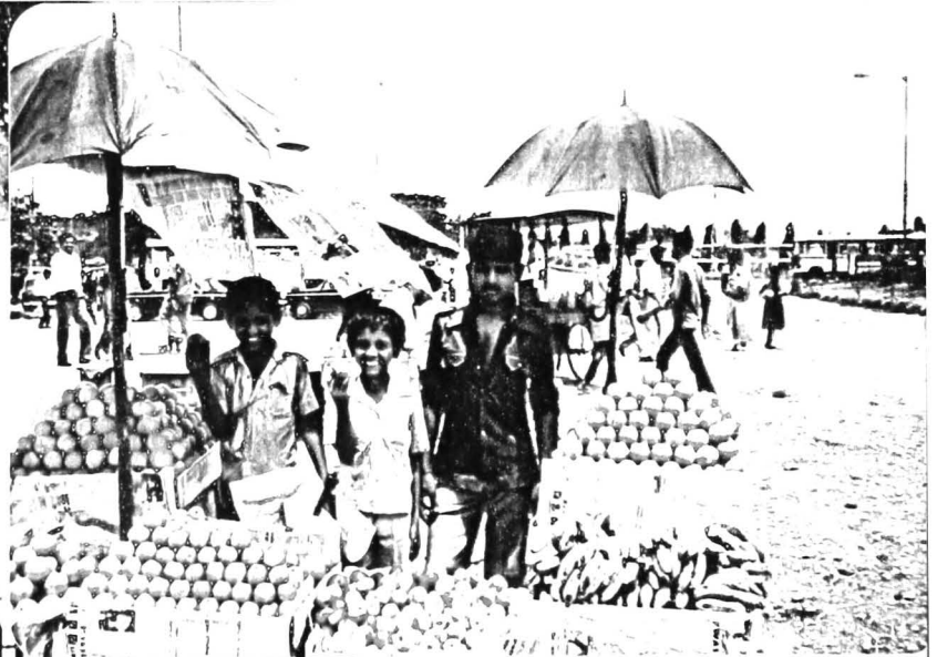
Above: Larger retailers Top: Prosperous retailer