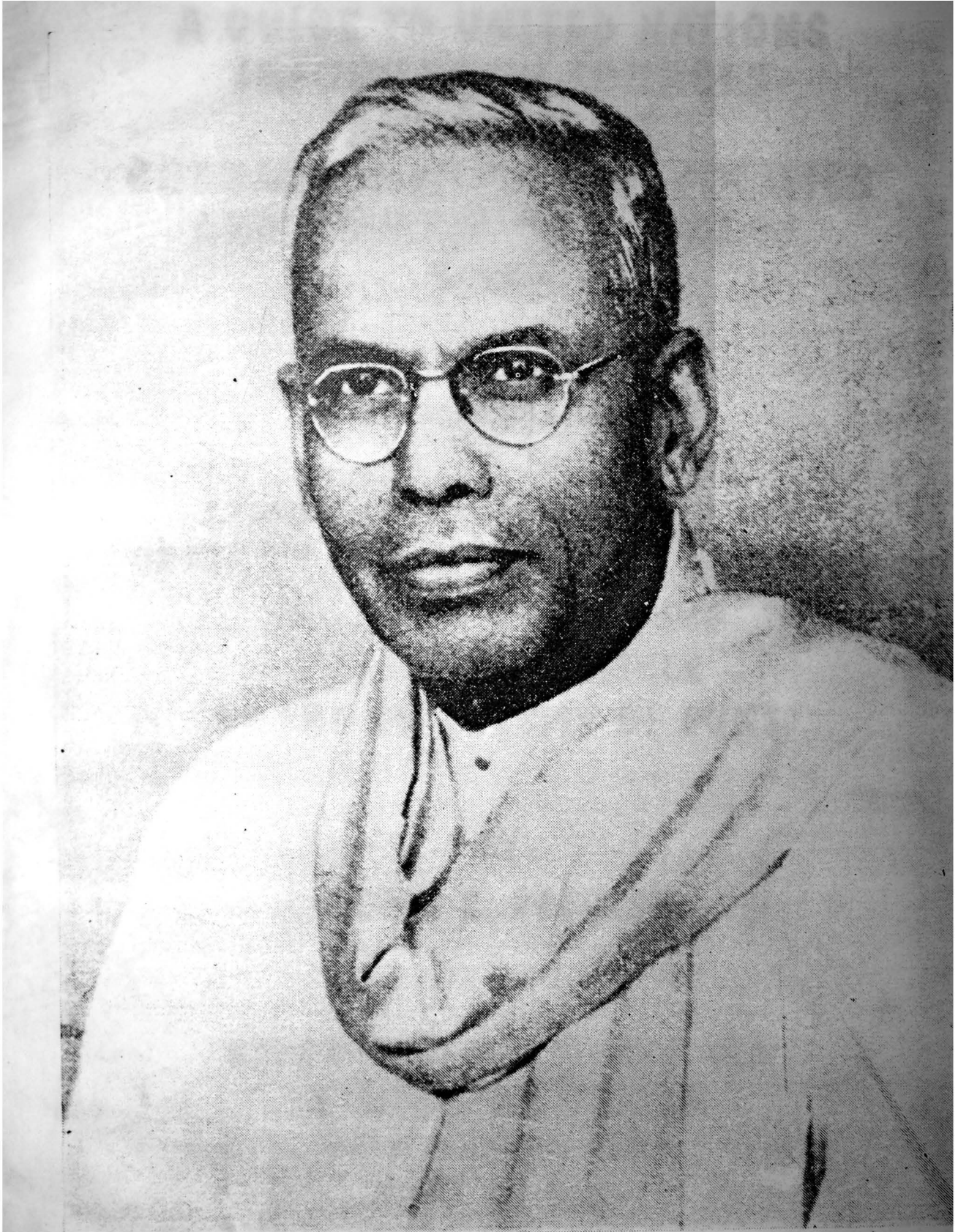
Dr. Shiyali Ramamrita Ranganathan, M.A., L.T., F.L.A., D.Litt., (1892-1972)

International Conference on Ranganathan's Philosophy: Assessment, Impact and Relevance