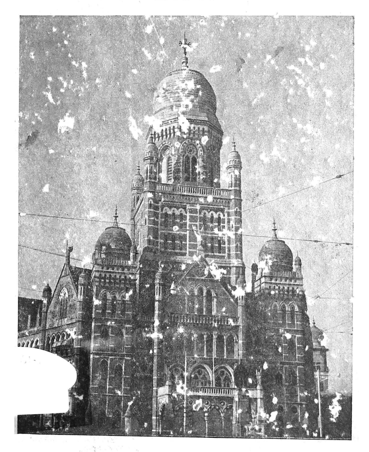
BOMPAY PRINTED AT THE MUNICIPAL PRINTING PRESS 1956