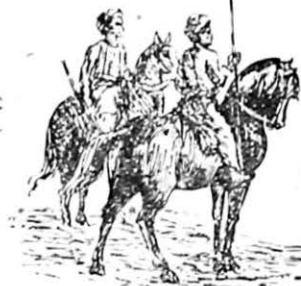
ON HORSE-BACK (CENTRAL INDIA)