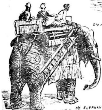
BY ELEPHANT (CENTRAL INDIA)