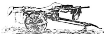
BULLOCK CART (DELHI)