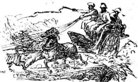
BY MAIL CART (GWALIOR)