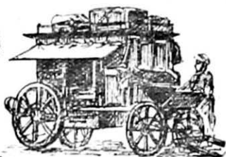
DAK GHARRY (AGRA)