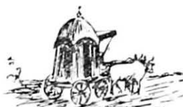
COVER'D BULLOCK CART (DELHI)