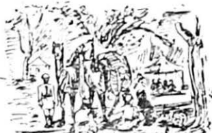
BY CAMEL (DEHRA DUN)