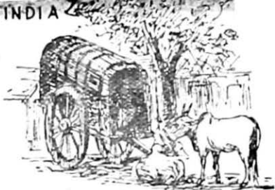
TRAVELLING WAGONS (WESTERN DELHI)