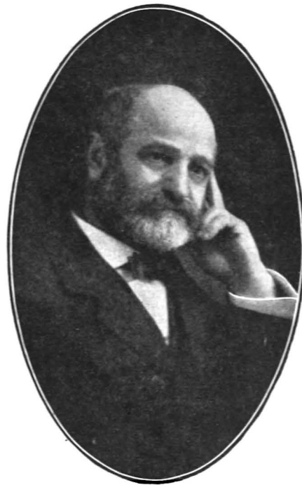
JOSEPH FELS (1853-1914)

Coming now to South America, our movement has made gigantic strides. We have no positive information as to whether the taxation on land values is in operation in any municipality beyond the very good news we heard here in this hall two days ago concerning Mendoza and Buenos Aires, but we know this much, that there are a great number of Municipal Councils in the Argentine