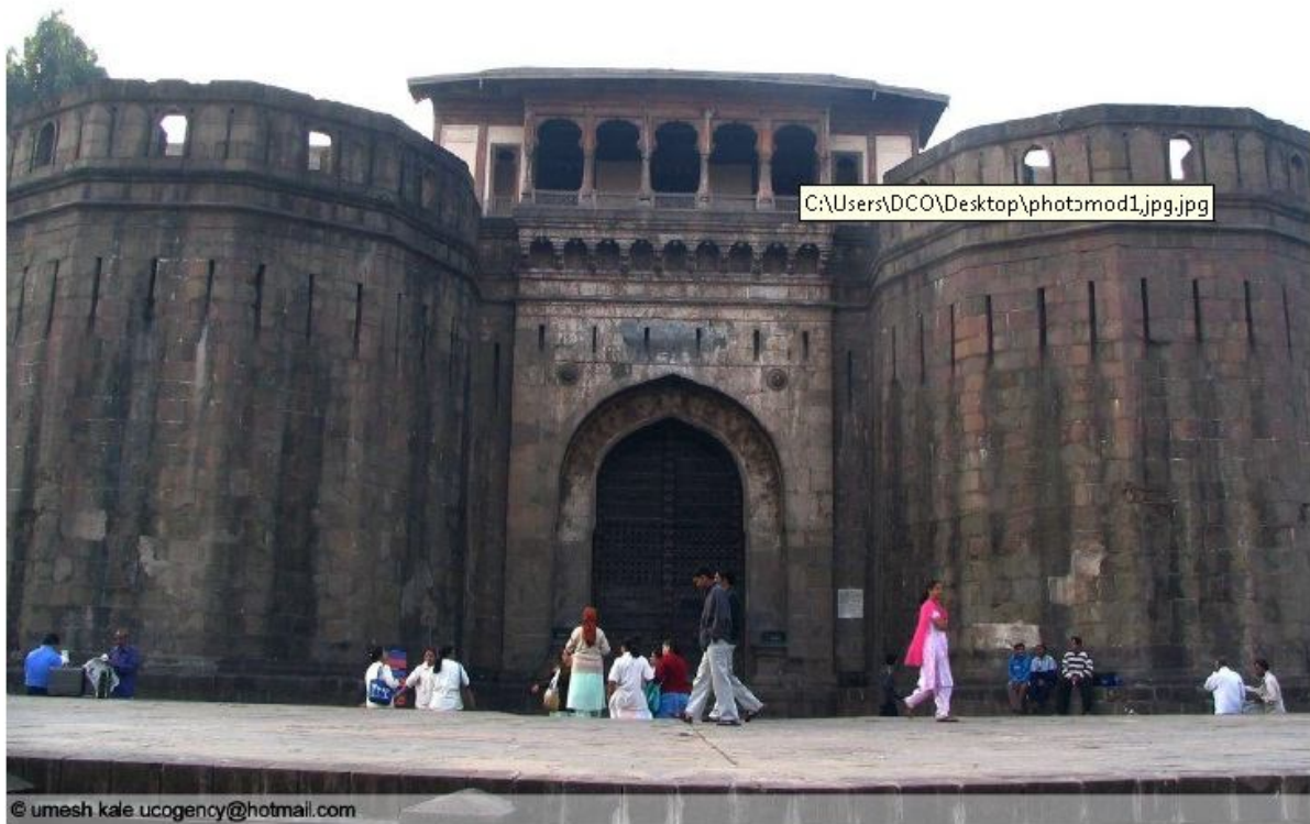
Shaniwar Wada, Pune

Shaniwar Wada was established by Bajirao Peshwa-I. The main door is about twenty one feet tall. The architecture of Shaniwar Wada was influenced by Moghul design and the hallmark of the Maratha craftsmanship. The door located in the north of the palace was named `Mastani Darwaza`. The present feature of Shaniwar Wada is not the actual one. Seven Peshwas later restructured the monument.