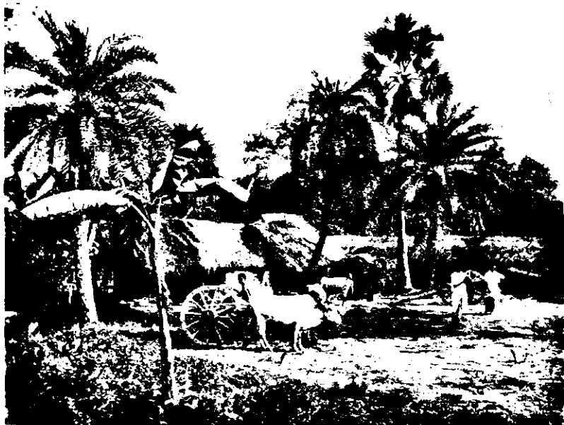
A TYPICAL VILLAGE SCENE, BENGAL