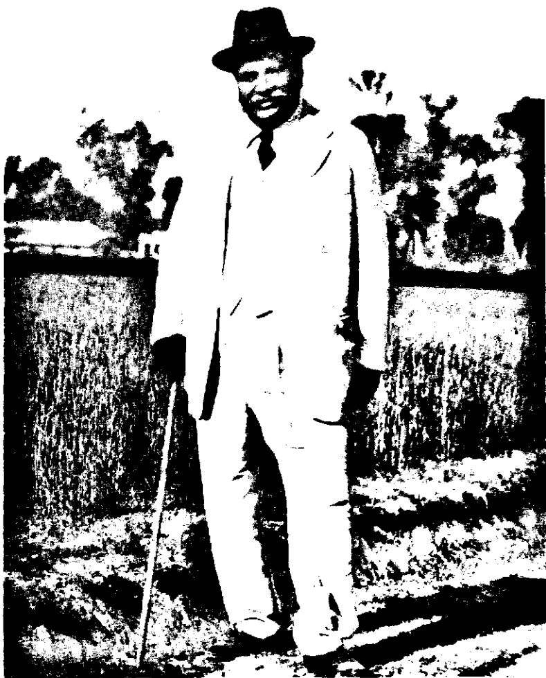
THE LATE SIR GANGA RAM, C.I.E., M.V.O. (Member, Linlithgow Agricultural Commission)