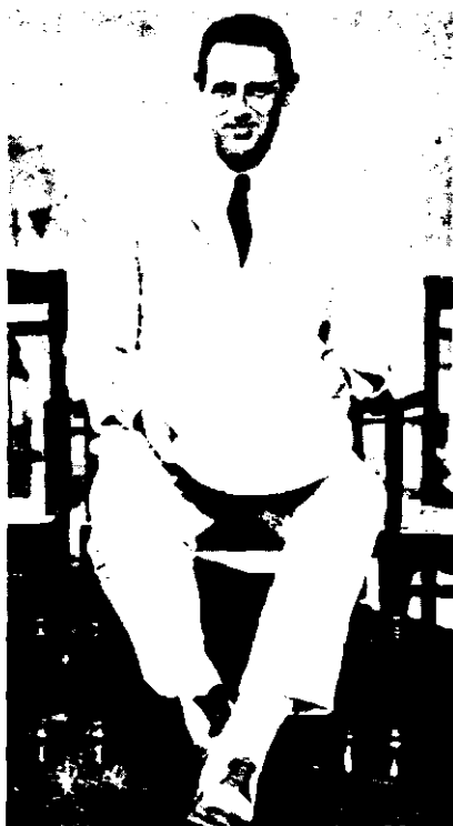
LORD LINLITHGOW IN BOMBAY, 1926