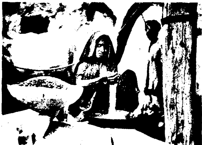
PEASANT WOMAN MEASURING WHEAT