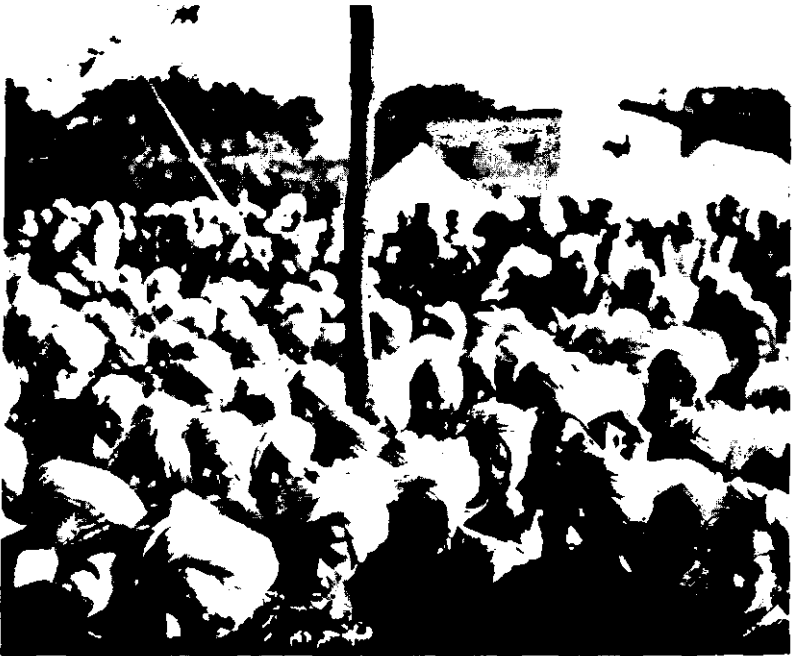
MEETING OF MEMBERS OF CO-OPERATIVE SOCIETY, SONEPAT, PUNJAB