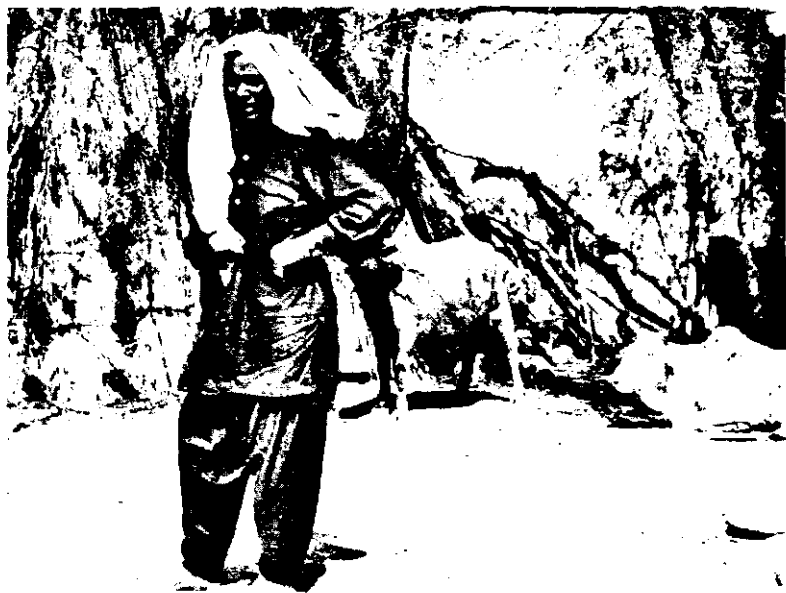
WIFE OF PUNJAB RYOT