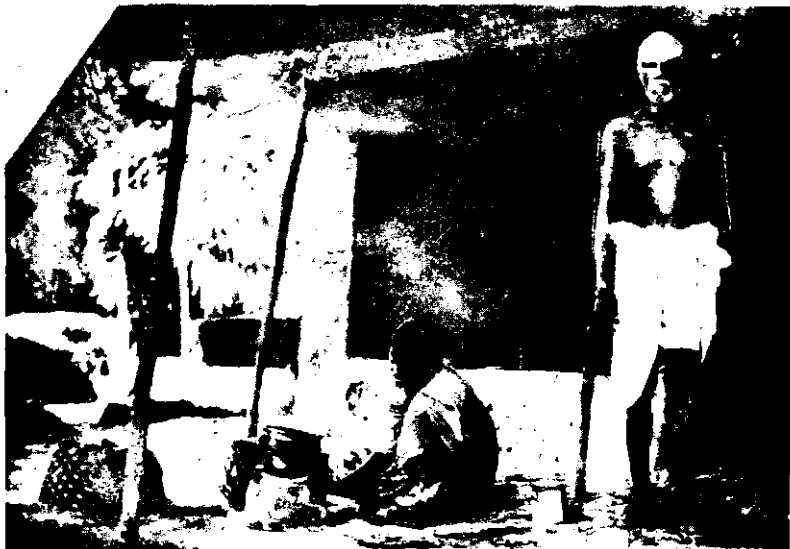
UNTOUCHABLES AT HOME. NEAR MADRAS