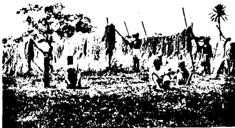
DRYING JUTE IN BENGAL