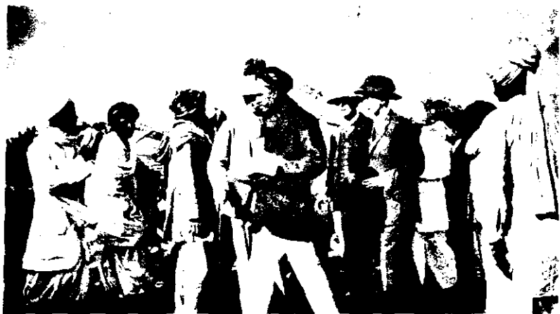
AKOLA COTTON MARKET