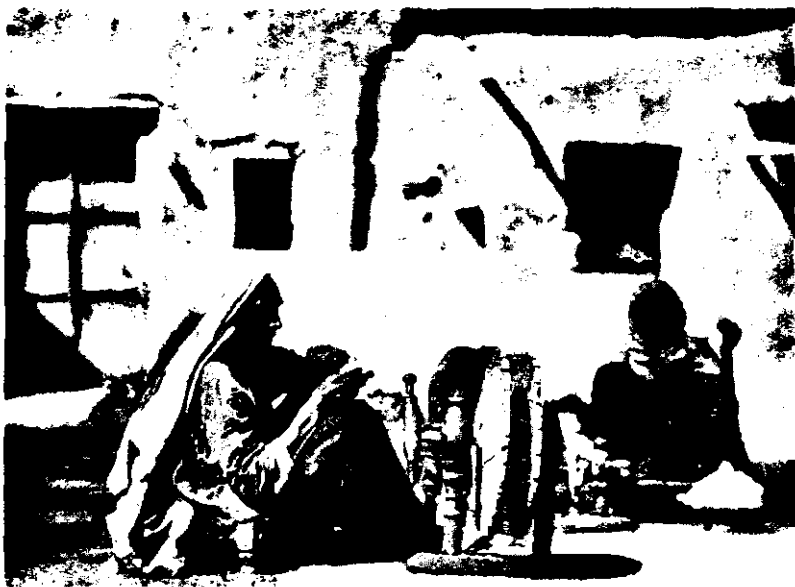
WOMAN WITH SPINNING WHEEL (Charka)