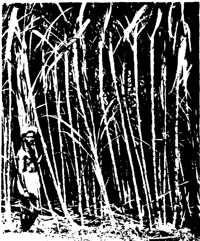
SUGAR CANE IN BENGAL