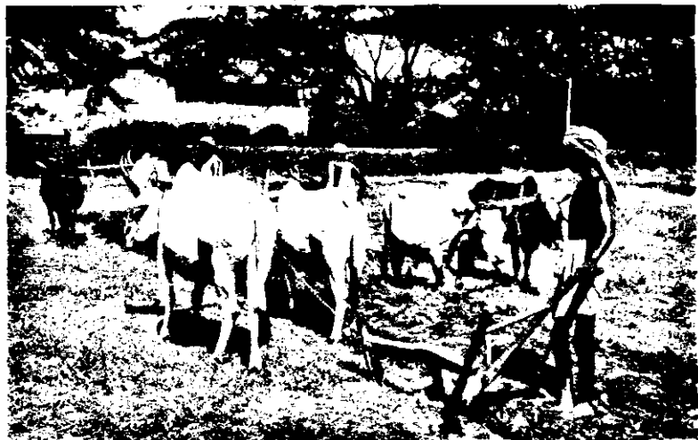
THE PUNJAB PLOUGH IN USE AT DACCA FARM