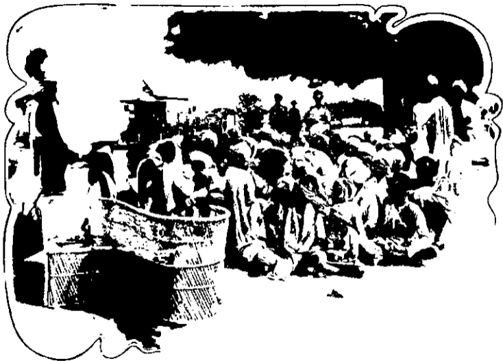
DAILY SERVICE FOR THE LABOURERS AT RAMABAI'S COLONY, CONDUCTED BY A CONVERTED BRAHMIN.