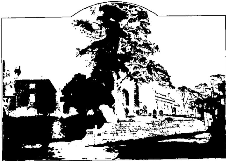
ASTLEY HOUSE, WHERE F. R. HAVERGAL WAS BORN; AND ASTLEY CHURCH, OF WHICH HER FATHER WAS MINISTER.