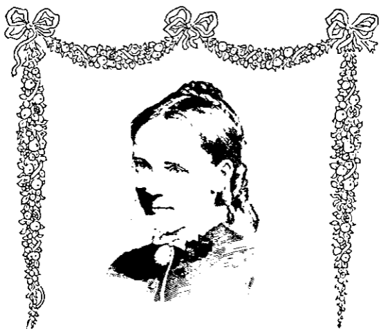
FRANCES RIDLEY HAVERGAL.