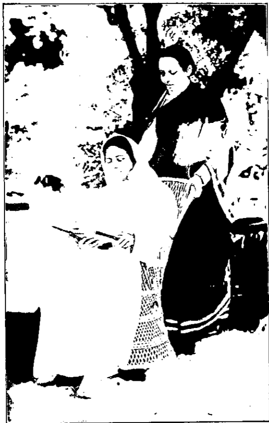
RAMABAI AND HER DAUGHTER MANORAMA.