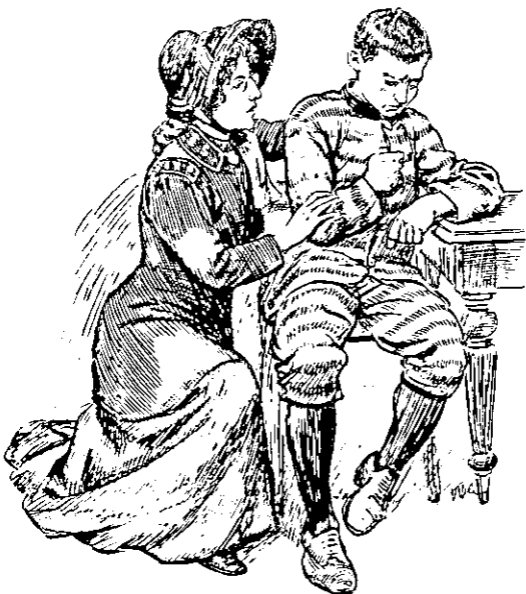
PLEADING WITH THE YOUNG MURDERER.

utterly inaccessible to good influence. This lad—he was indeed scarcely more than a child in years—had lately been sentenced to the longest possible term of imprisonment for no less a crime than the deliberate murder of a boy