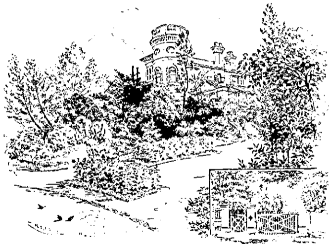
WESTWOOD, BEAULAH HILL, UPPER NORWOOD.