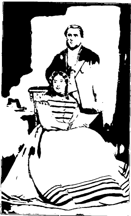
AN EARLY PORTRAIT OF MR. AND MRS. SPURGEON, TAKEN IN THEIR HOME.