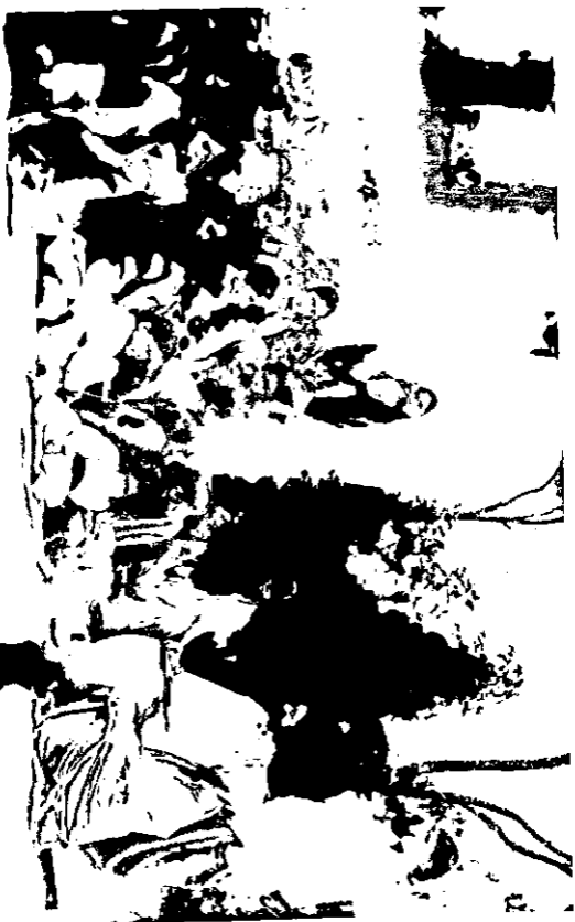
THE FIRST OF KAMAHU'S CHILDREN.