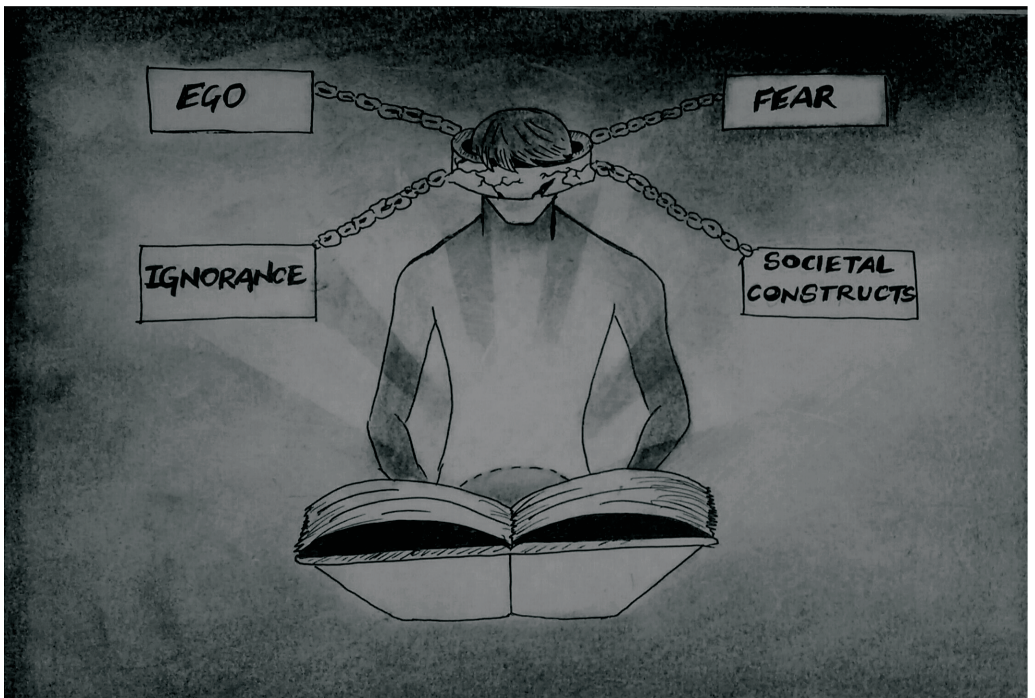
Illustration by Kiran Awale

And thus your freedom when it loses its fetters becomes itself the fetter of a greater freedom.