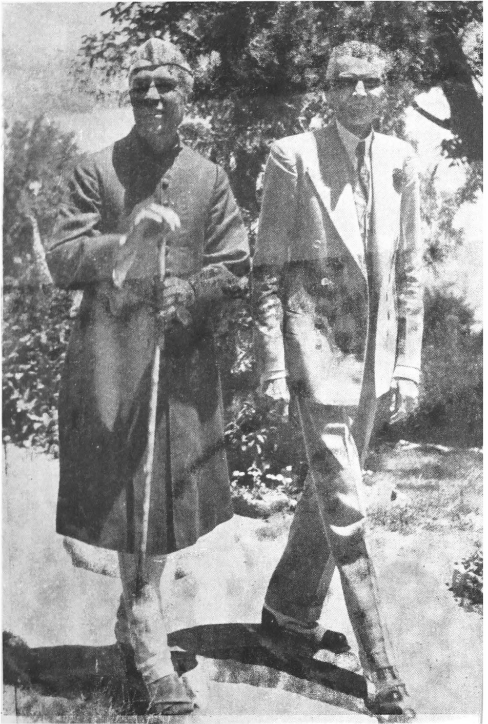
Pandit Nehru meets Mr. Jinnah.