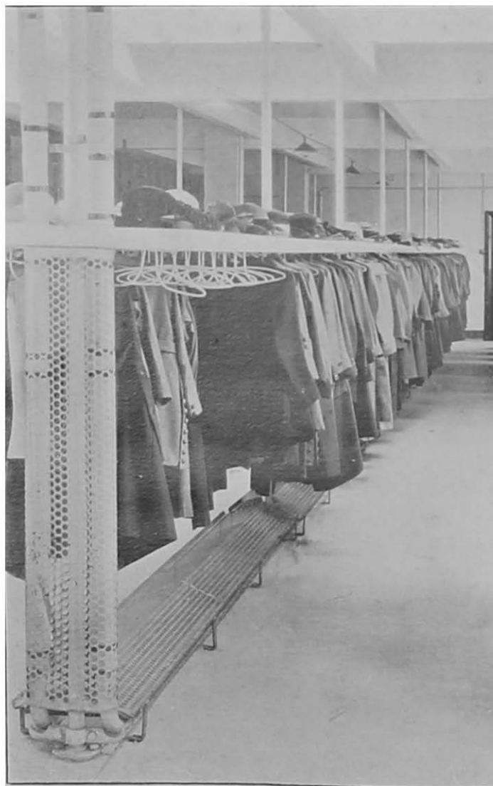
A CLOAK-ROOM AT THE COCOA WORKS (See page 34)