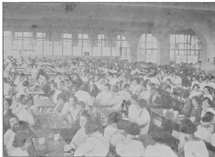
A BAY IN THE GIRLS' DINING HALL