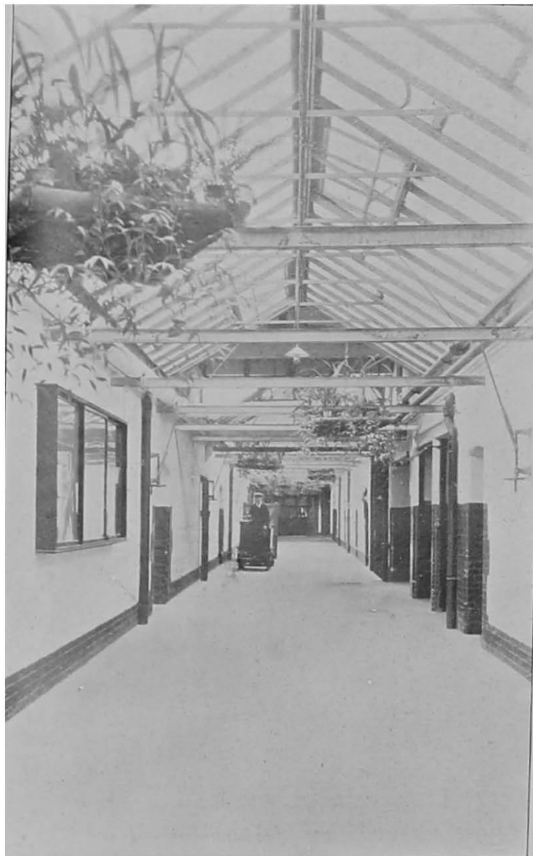
A TYPICAL CORRIDOR SHOWING HANGING PLANTS