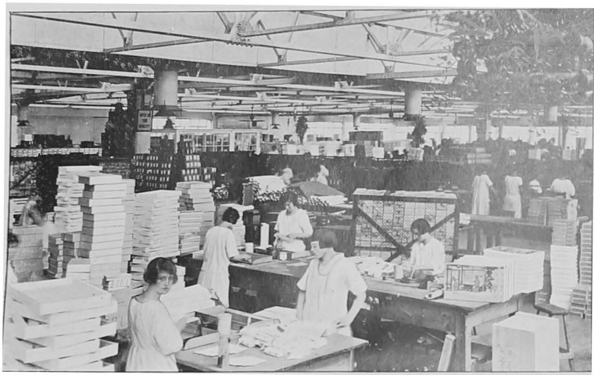
A WORKROOM IN THE CARD BOX DEPARTMENT