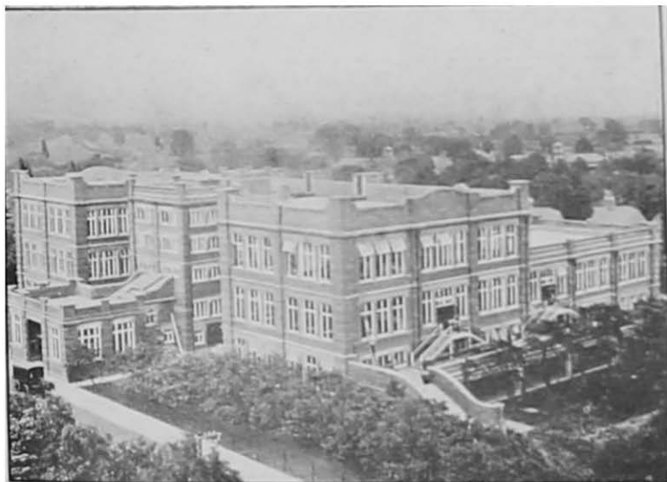
DINING BLOCK (including Canteens, Gymnasia, Lecture Hall, Class Rooms and Dental Department)