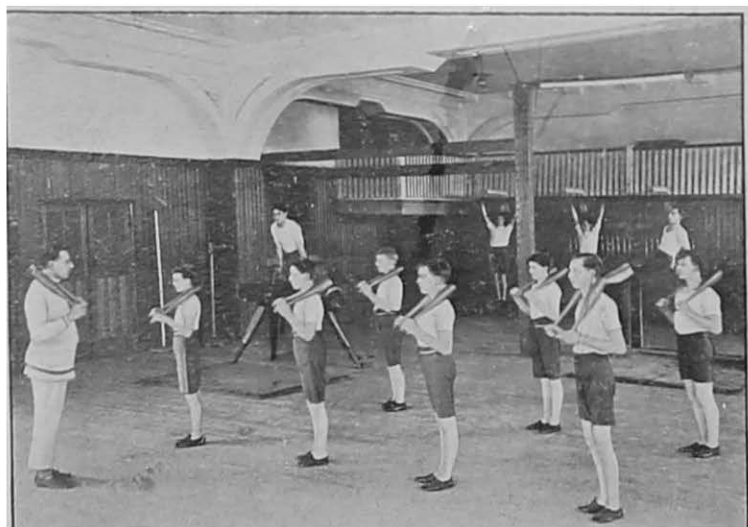
THE BOYS' GYMNASIUM