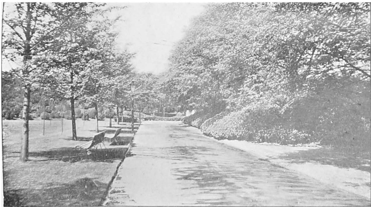
AN ENTRANCE TO THE COCOA WORKS, YORK