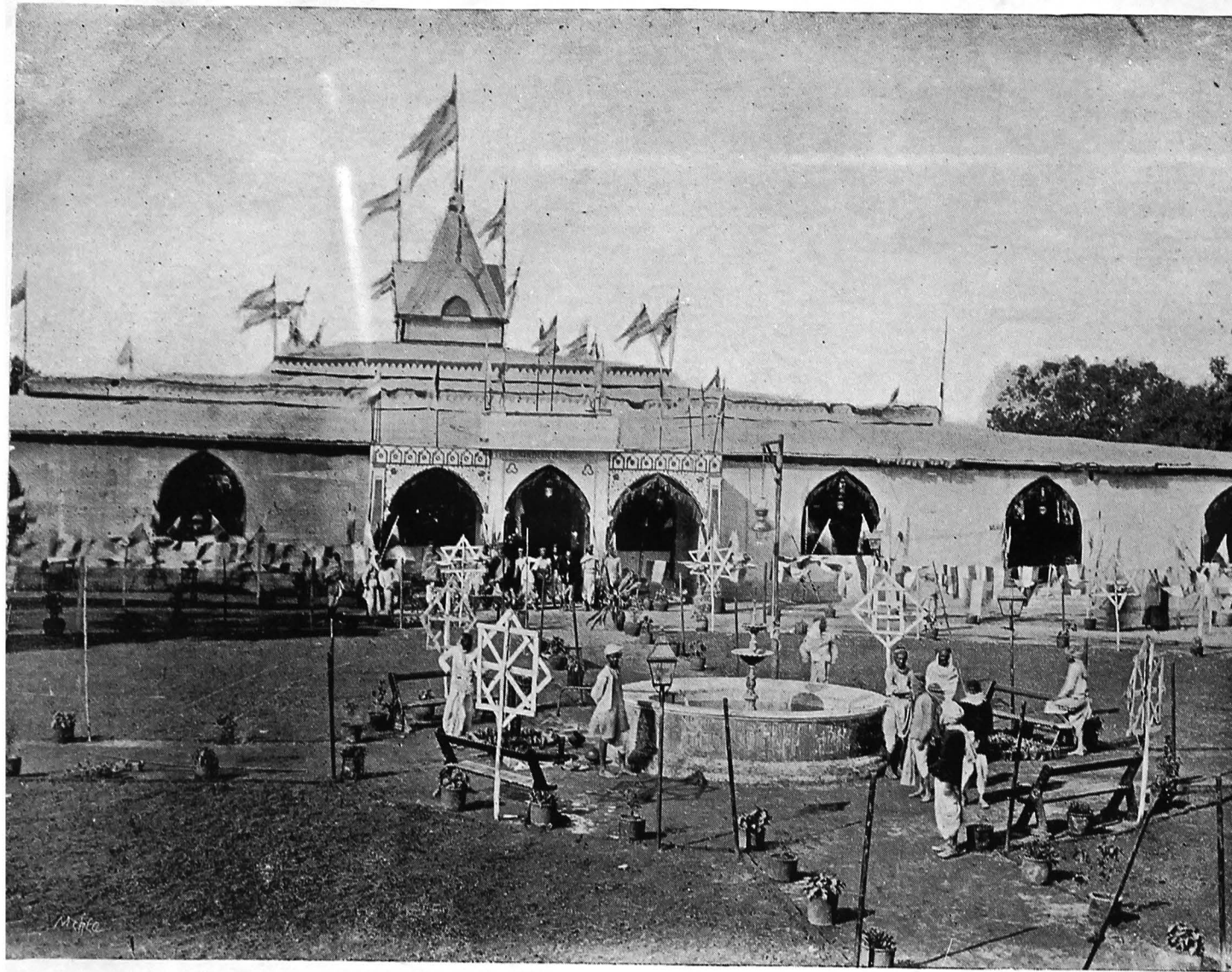
Entrance to the Congress Pavilion, Ahmedabad, 1902.