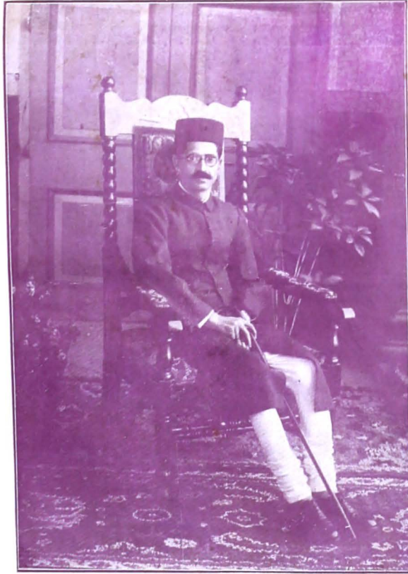
Pandit Hirday Nath Kunzru.