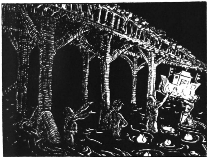
LANTERNS DOWN THE RIVER