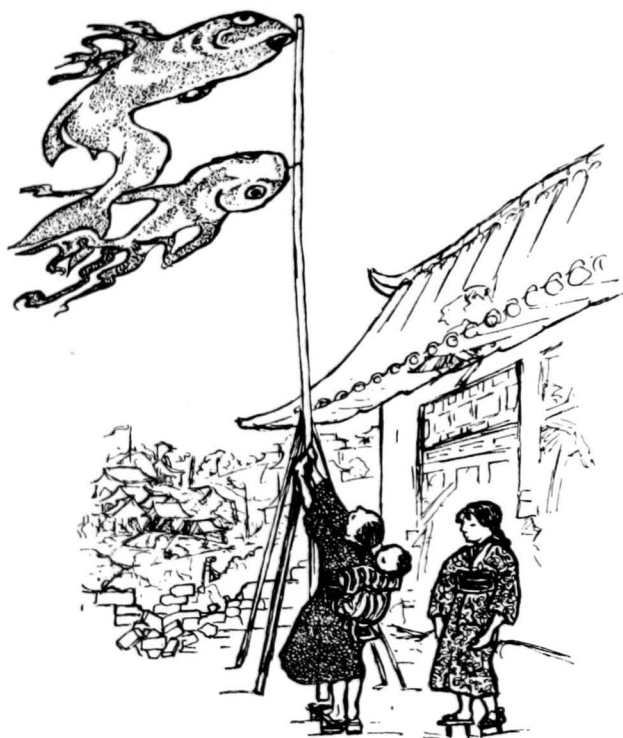
SONS AND FISHES