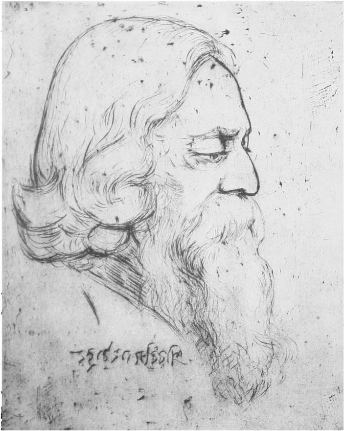
Rabindranath Tagore From the dry point by Mukul Dey