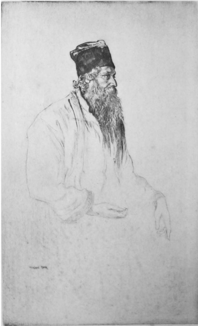
Rabindranath Tagore From the dry point by Muirhead Bone