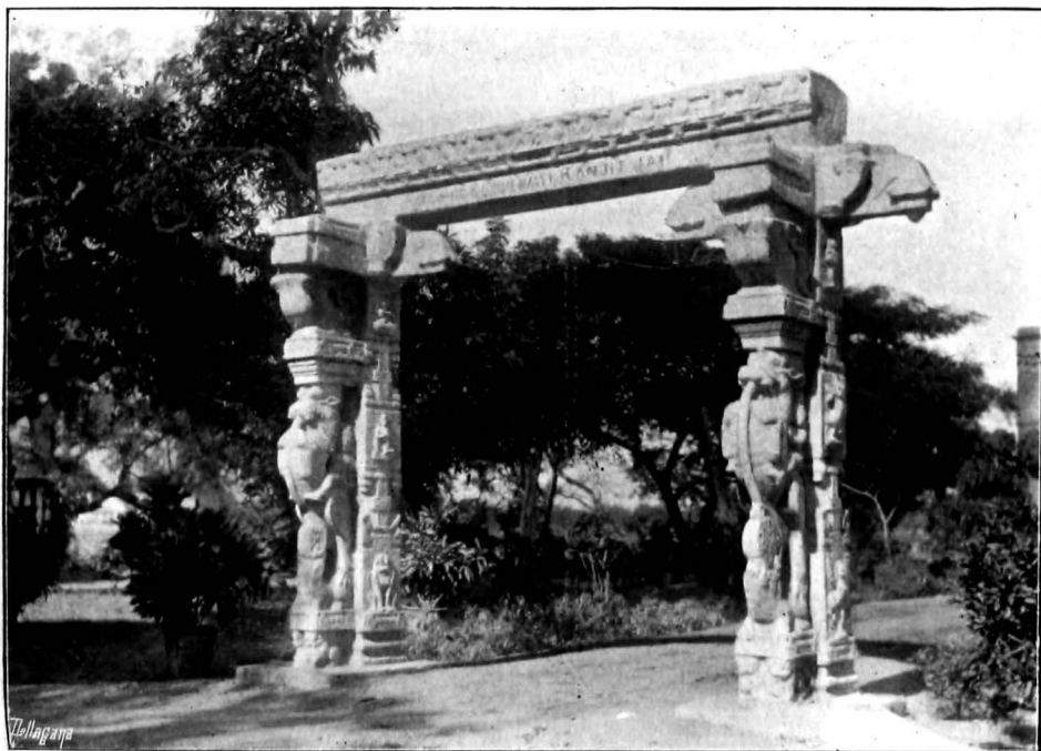
ANCIENT RUINED TEMPLE PORTAL, ADYAR.