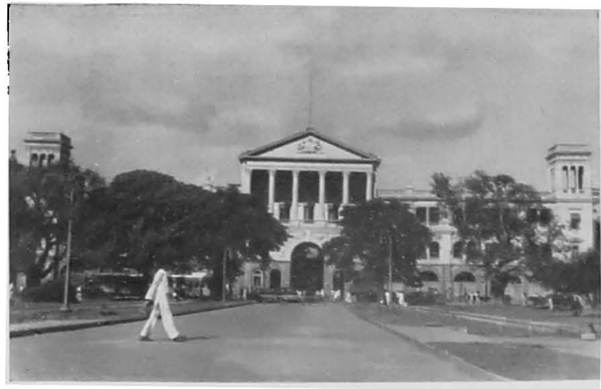
The Esplanade location (1923-1942)