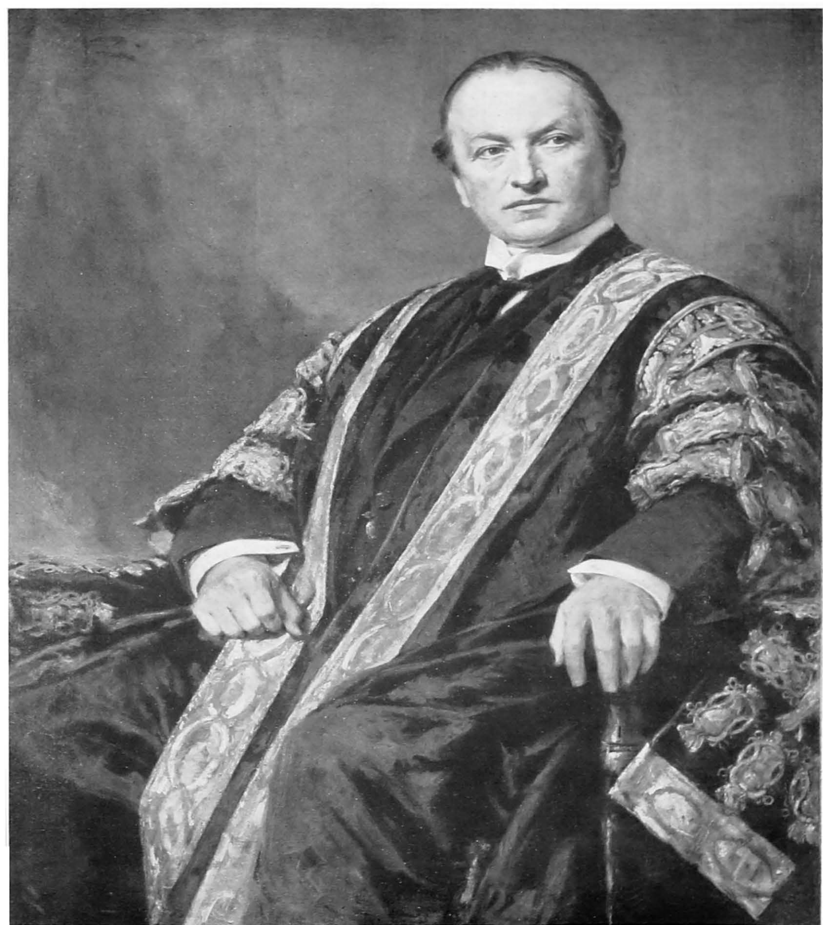
Lord Curzon, who inaugurated the Imperial Library.