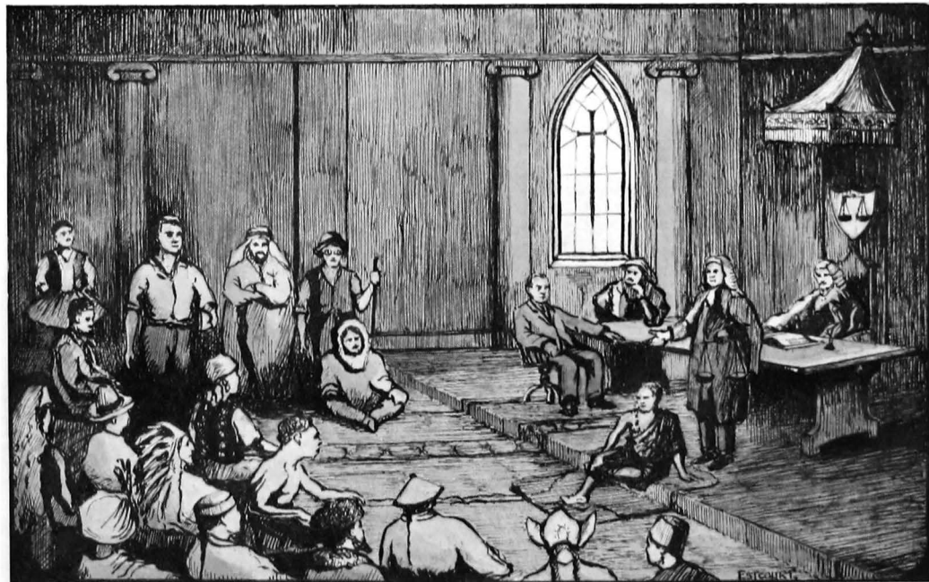
AFRICA AT THE BAR OF JUSTICE