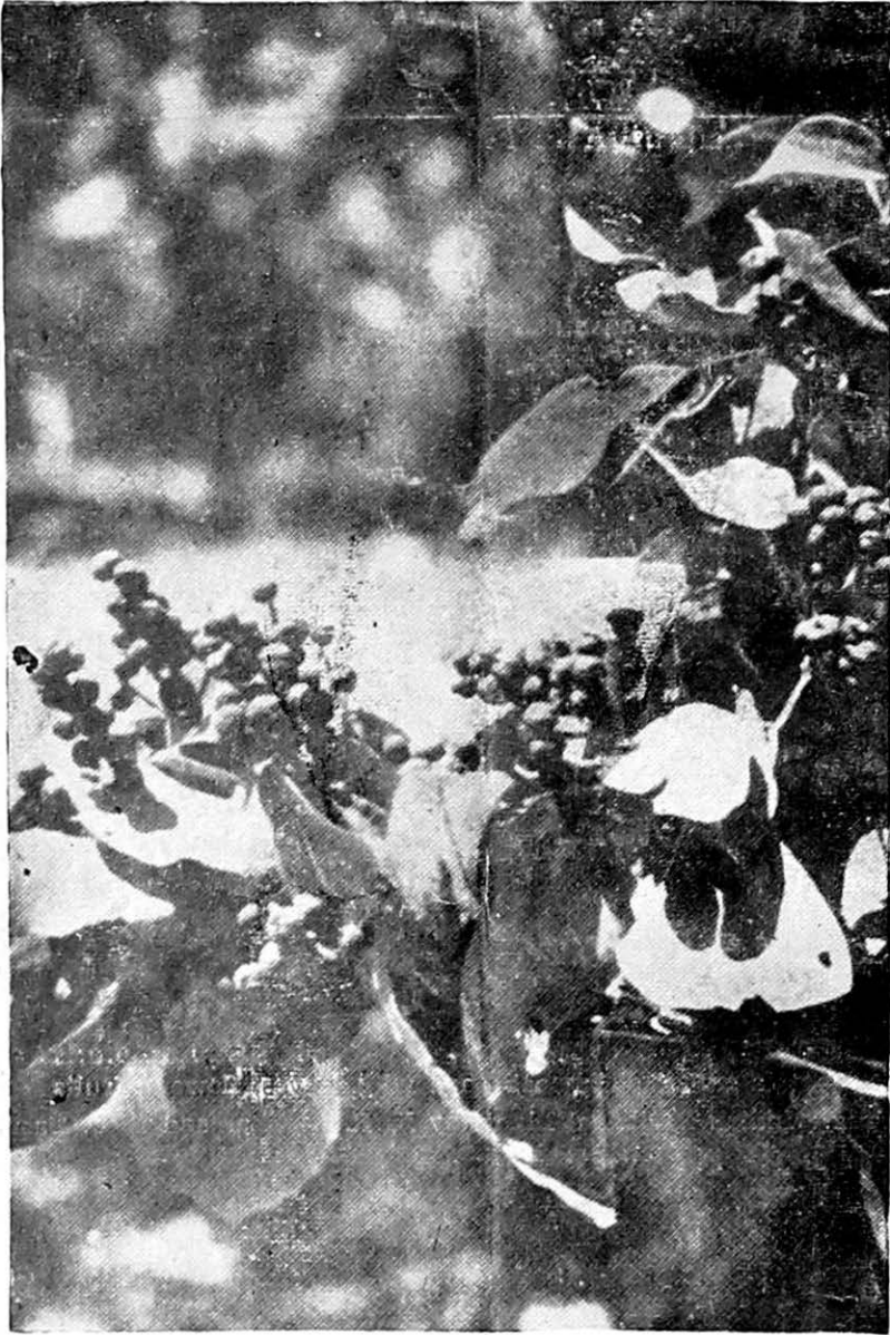
CLOSE UP OF A KAMALA TREE BRANCH WITH CLUSTER OF FRUITS.