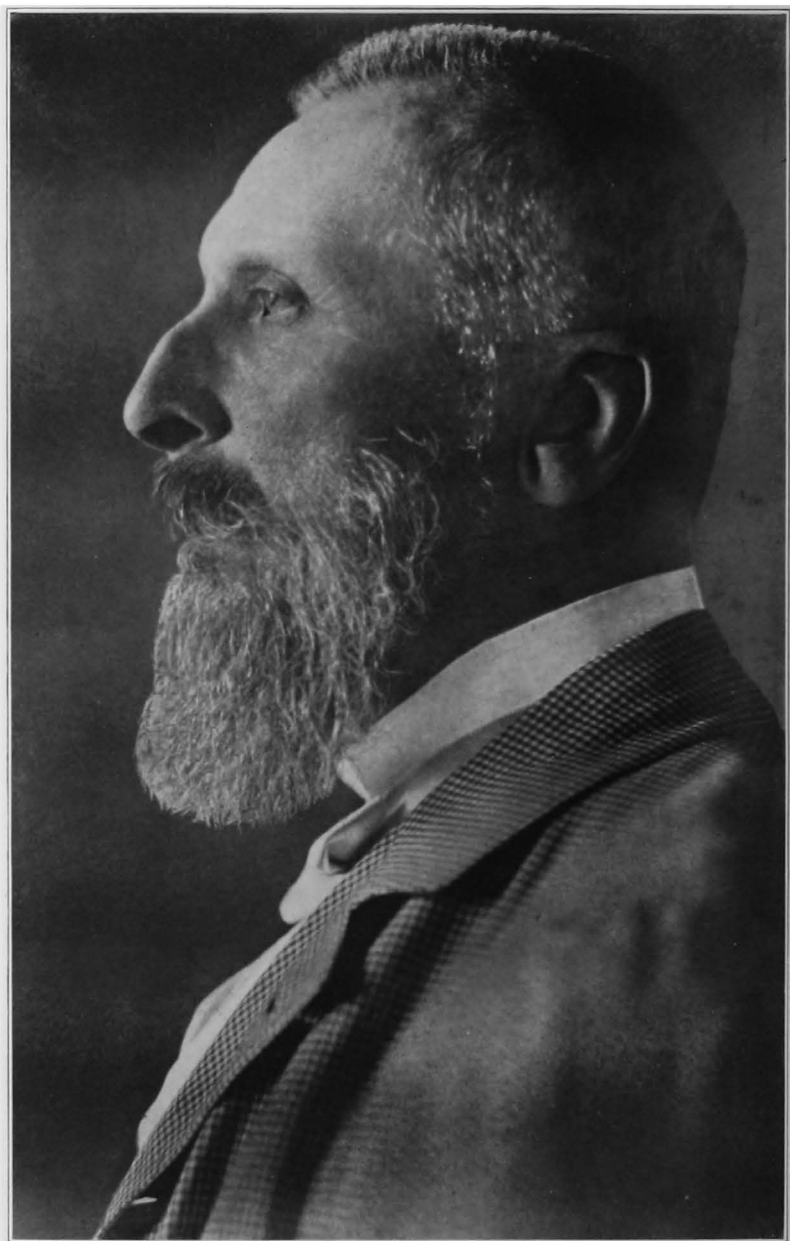
COUNT ALBERT APPONYI