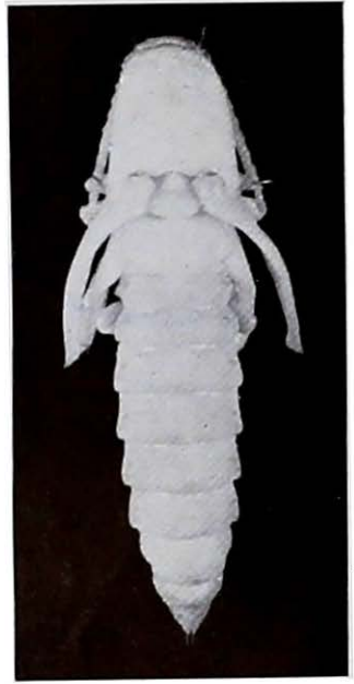
Fig. 4.—Pupa, magnified.