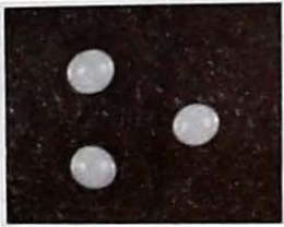
Fig. 2.—Eggs, magnified.