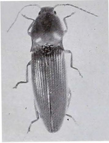
Fig. 1.—Adult, magnified.