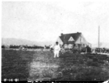
FIGURE 4 Alfalfa growing on Rogers Mesa, Colorado; May 15, 1948.