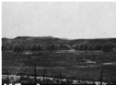
FIGURE 5 Flooded river bottom, irrigated pasture, and very dense vegetation below Slater, Wyoming, May 20, 1948.