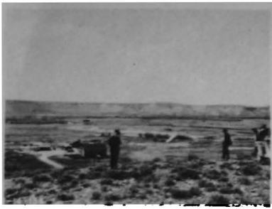
FIGURE 10 Farm in Green River Valley, Wyoming, near junction of East Fork and Green River. Sparse native vegetation in foreground, irrigated pasture and dense native vegetation in background, May 22, 1948.