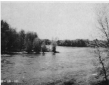
FIGURE 12 Little Snake River at high stage, Wyoming-Colorado. Cottonwood trees and willows are typical and very dense riparian vegetation, May 20, 1948.