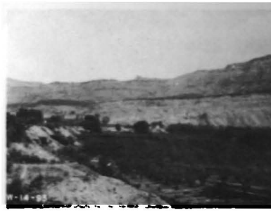
FIGURE 8 Peach orchard growing along Colorado River near Palisades, Colorado, May 17, 1948.