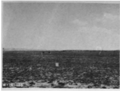
FIGURE 2 Alfalfa field, near Big Piney, Wyoming, May 22, 1948.