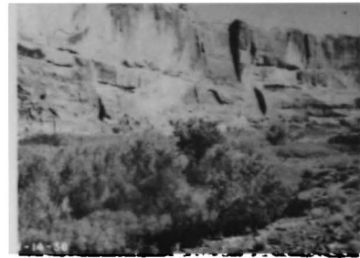
FIGURE 15 Dense Tamarisk (salt-cedar) growing along Colorado River near Moab, Utah, May 12, 1948.