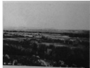
FIGURE 17 San Juan River Valley about five miles below Blanco, New Mexico. Willows, Tamarisk and Cottonwood trees growing along river. May 8, 1948.