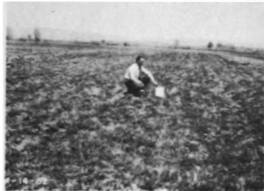
FIGURE 3 Alfalfa growing on bench lands two miles east of Lake Park, Utah, May 13, 1948.