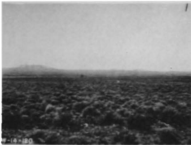
FIGURE 11 Sage brush growing between Parson and Pinedale, Wyoming, May 21, 1948.