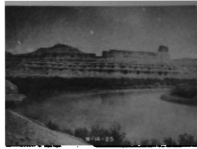
FIGURE 14 Very dense native vegetation (cottonwoods) (willows) growing along Green River above irrigated lands Green River, Utah. May 12, 1948