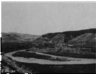
FIGURE 13 White River valley about 10 miles above Rangely, Colorado. Medium native vegetation growing in river channel. May 14, 1948.