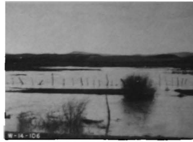
FIGURE 6 Yampa River overflowing bottom lands about eight miles below Steamboat Springs, Colo. May 19, 1948.