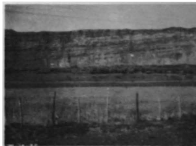
FIGURE 9 Grain field, flooded pasture, cottonwood trees in background along Colorado River West, Utah, May 12, 1948.