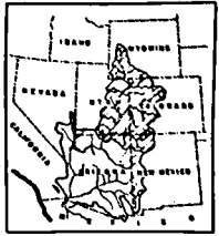
FIGURE 2—GENERAL LOCATION OF IRRIGATED LAND AREAS AND SELECTED WEATHER BUREAU STATIONS IN THE UPPER COLORADO RIVER BASIN