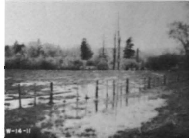
FIGURE 7 Flood irrigation of pasture about four miles from Bayfield, Colorado, on Pine River, May 10, 1948.