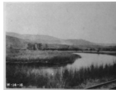
FIGURE 16 Dense willows growing along Animas River two miles above Durango, Colorado. May 11, 1948.