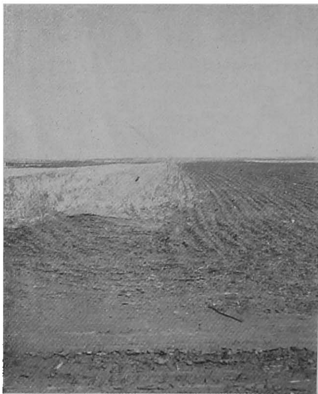
FIGURE 2.—Dust accumulation in stubble adjacent to fallow which was moldboard plowed during 1947 fallow season. Photo taken May 21, 1948.

Basins overtopped, causing dams between basins to break, and some were completely washed out. In many places soil was washed away to a depth considerably below the original depth of the basins. Figure 7 shows what happened to basin listing on a very slight slope during the storm of July 17,