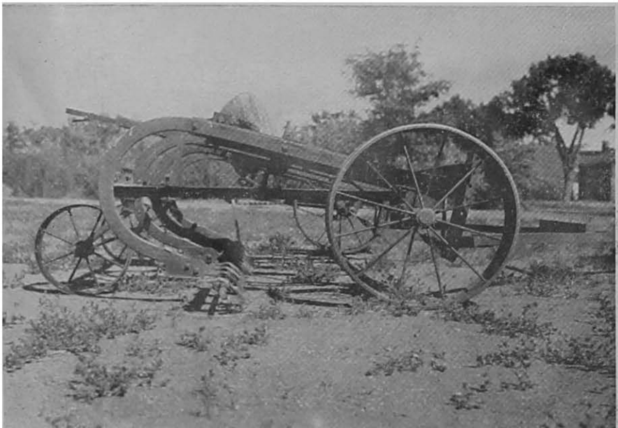
FIGURE 13.—Rod weeder with shovel attachments.

Sturdiness of construction is also important in a sub-surface tiller. If the machine is not well built, breakage and bending will result. With the large sweeps generally present on sub-surface tillers it is especially important that these sweeps be kept running as true as possible. It is difficult to get a sub-surface tiller to operate satisfactorily if the sweeps or beams are bent.