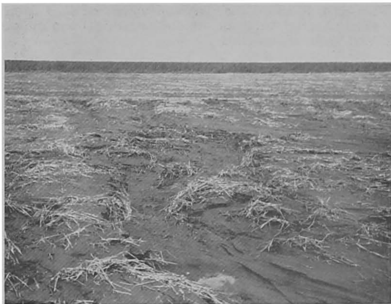
FIGURE 6. —Erosion caused by runoff from stubble mulch fallow during rain described in figure 4. While stubble mulch fallow did not prevent erosion under these conditions, it was less severe on this type of fallow than on any other type included in this project.