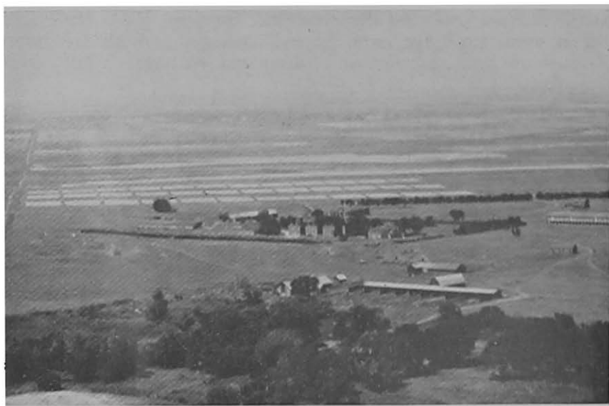
FIGURE 9.—Aerial view of buildings at North Montana Branch Station, Havre, Montana. Plots used in this work are in the background.

According to weather records kept at the North Montana Branch Station, the average annual precipitation for the past 32 years is 11.59 inches. The period covered in this report, 1941 through 1947, had an average annual precipitation of 11.29 inches. The precipitation during 1941 and 1942 was above the 32-year average, but each year since 1942 has been below the 32-year average. June is normally the month of highest rainfall. The average precipitation for the month of June for the period 1941 through 1947 was 3.33 inches; this was 29.5 percent of the average annual precipitation for the seven-year period. The average total precipitation for the months of May, June, and July for this period was 5.64 inches, which was 50 percent of the average annual precipitation.