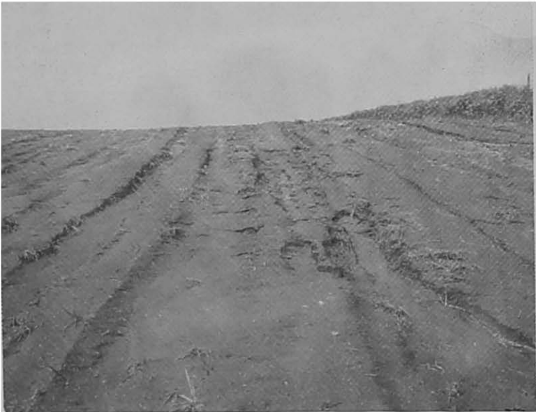
FIGURE 5.—Erosion caused by runoff from moldboard plowed fallow during same rain described in figure 4.