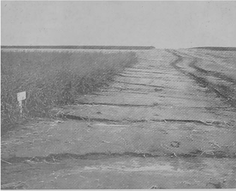
FIGURE 4.—Erosion caused by runoff from cropped land during rain of July 17, 1945, when 1.65 inches of rain fell in 15 minutes.