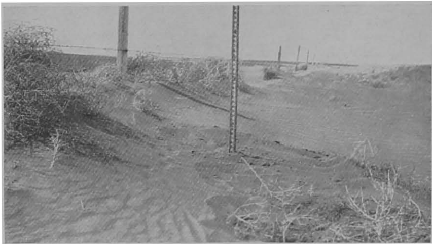
FIGURE 10.—Accumulation of drifted soil in fence row and borrow pit adjacent to fallow field. Photo taken 12 miles northwest of Havre, Montana, after high winds which occurred during the spring of 1948.

Soil drifting has not had much opportunity to occur. The fallow strips are only slightly over 10 rods in width, and they run in a north-south direction. In addition to this, a fair cloddy mulch has been present on most of the plots during periods of high wind velocity.