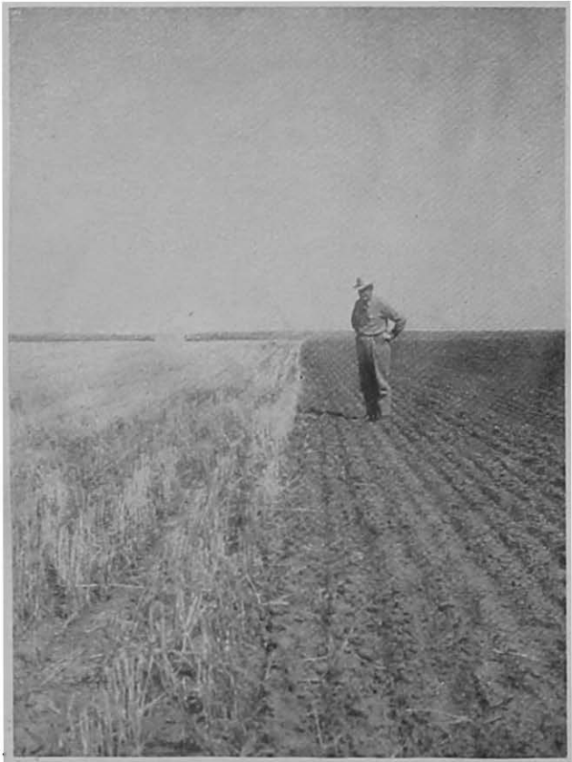
FIGURE 1.—Stubble adjacent to fallow which was sub-surface tilled during 1947. No place was there evidence of soil drifting adjacent to stubble mulch. Photo taken May 21, 1948.

Moldboard plowed fallow has shown the greatest tendency to drift. One-wayed fallow has been equally bad at times, but on the average it has been a little more resistant. If used too often and at excessive speeds, the one-way can set up conditions which are very favorable for wind erosion. The soils on the experimental farm are very easily pulverized, and clods are almost impossible to maintain during the fallow period. Where a "waffle"