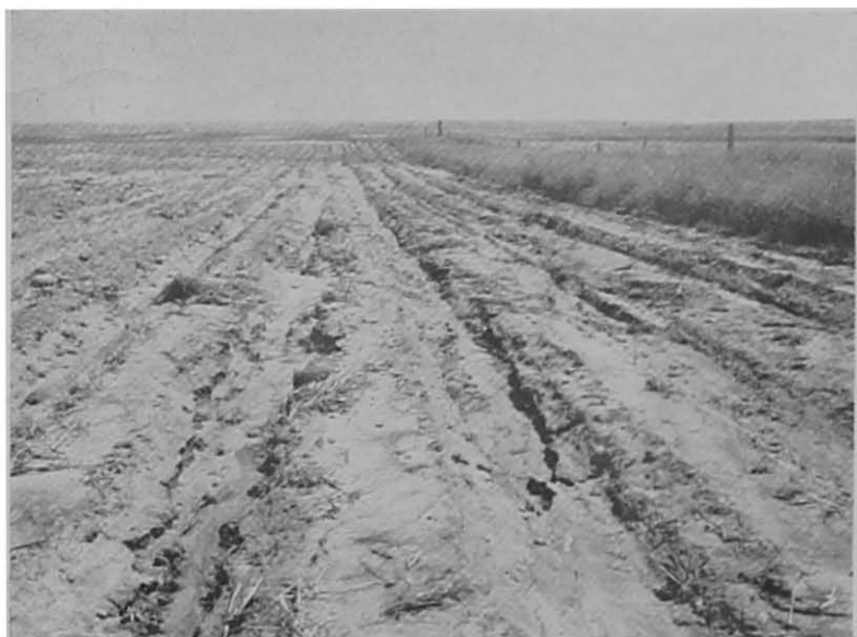
FIGURE 7. —Erosion caused by runoff from basin listed fallow during rain described in figure 4. This illustrates the danger of basin listing unless it is done on the contour or relatively level land. Overtopping of one basin causes basins on down the slope to break.