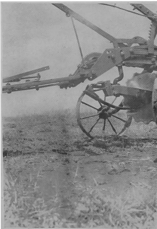
FIGURE 8.—Trash guard attached in front of colter. This attachment is helpful when working in heavy stubble or trash.

Burning of stubble prior to spring plowing where wheat followed wheat resulted in an average yield of 25.4 bushels per acre as compared with 24.1 bushels where the stubble was plowed under. Stubble was quite heavy during the period of years included in this study and no doubt caused some drying