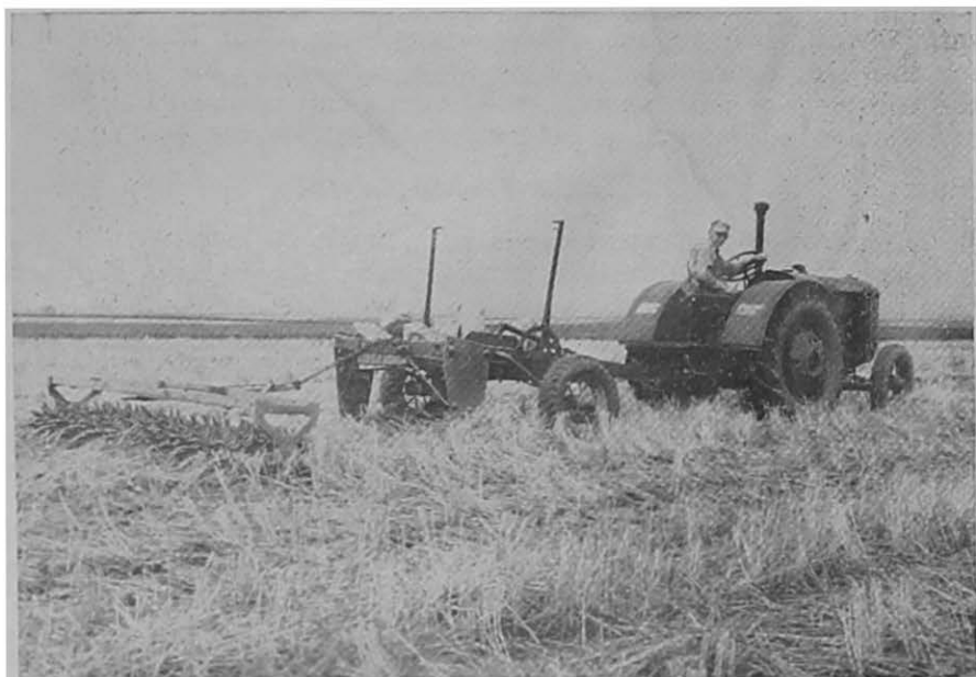
FIGURE 14.—A treader being pulled in tandem with a sub-surface tiller. The sub-surface tiller is weighted so a uniform depth of operation can be maintained.

not be used because it will pulverize the soil and create conditions which favor soil drifting.