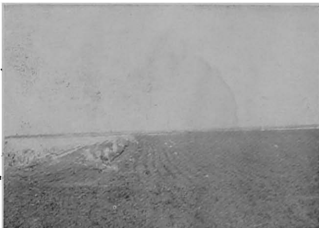
FIGURE 3.—Dust accumulation in stubble adjacent to fallow which was onewayed during 1947 fallow season. Photo taken May 21, 1948.

Basins overtopped, causing dams between basins to break, and some were completely washed out. In many places soil was washed away to a depth considerably below the original depth of the basins. Figure 7 shows what happened to basin listing on a very slight slope during the storm of July 17,