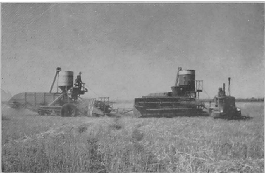
FIGURE 12.—The use of straw spreaders on combines prevents excessive accumulation of straw in windrows.

If the crop is harvested with a combine, a straw spreader should be used to prevent an excessive accumulation of straw in windrows. Heavy windrows of straw are apt to cause difficulty during fallow operations and at seeding time.