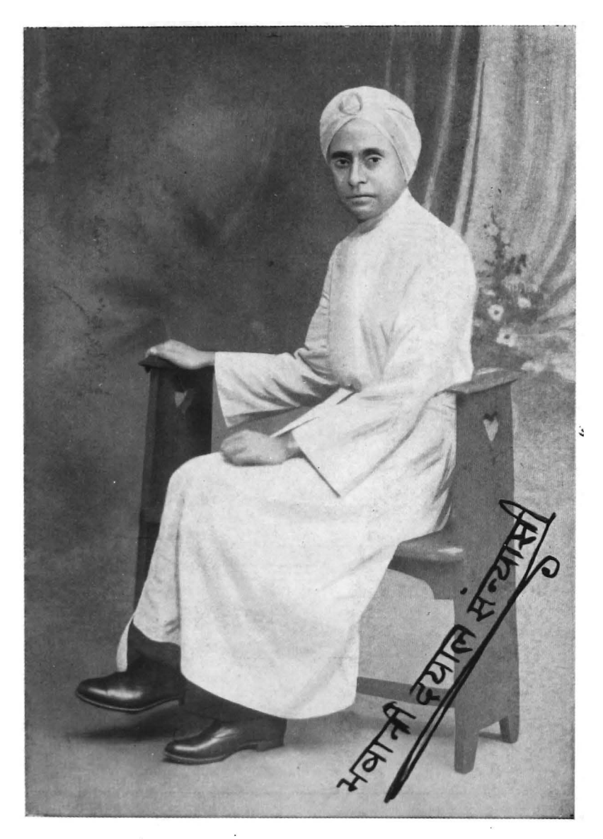
SWAMI BHAWANI DAYAL SANNYASI (1936)