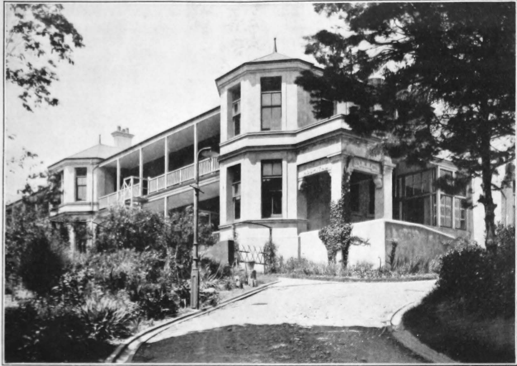
THE ST. HELEN'S HOSPITAL, WELLINGTON, NEW ZEALAND.