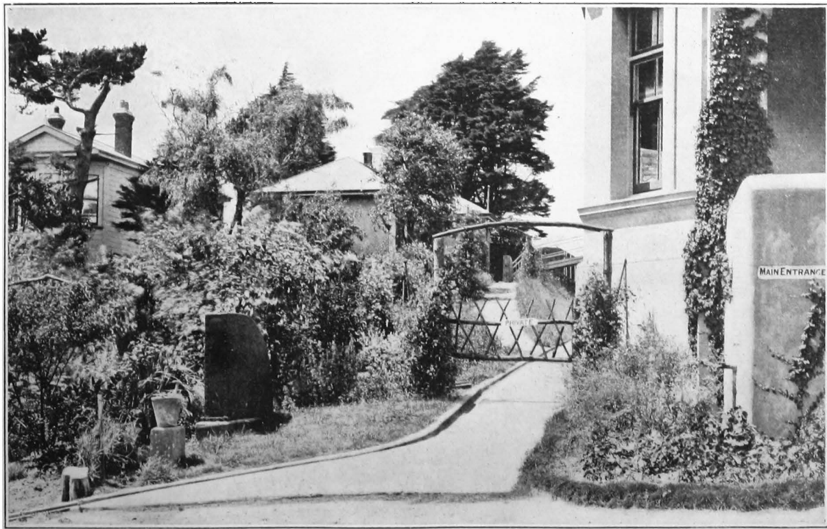
VIEW OF THE GROUNDS, ST. HELEN'S HOSPITAL, WELLINGTON, NEW ZEALAND.