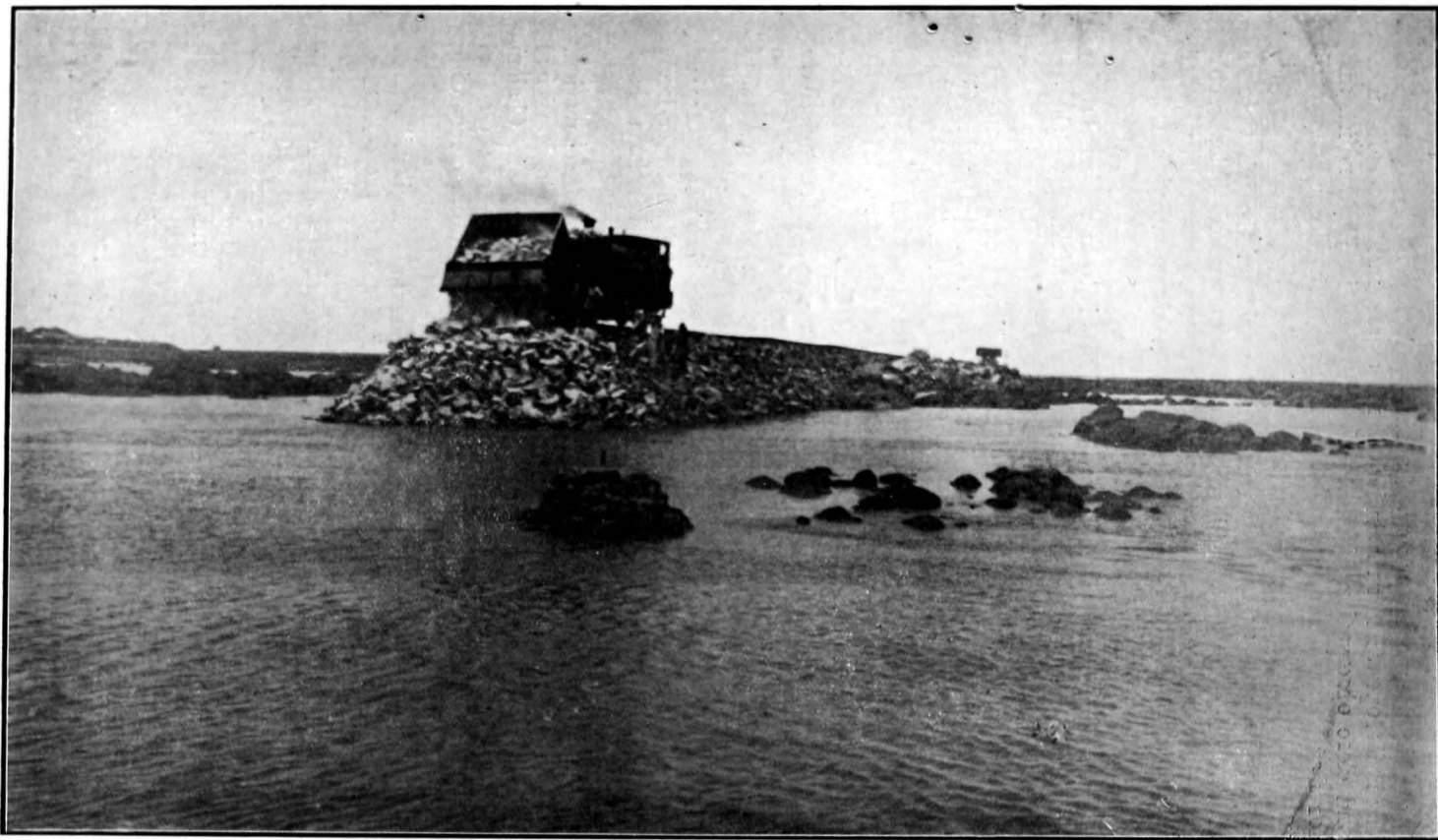
End Tipping Rubble Mound at R. D. 5,500 (From outside).