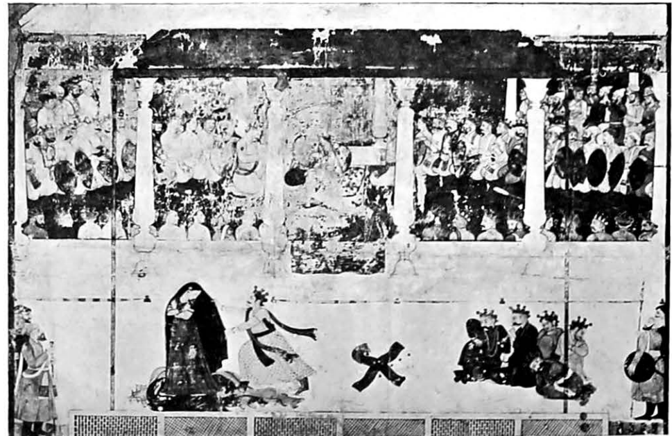
THE GAMBLING SCENE FROM THE "MAHĀBHĀRATA". PAHĀRĪ. LAHORE MUSEUM