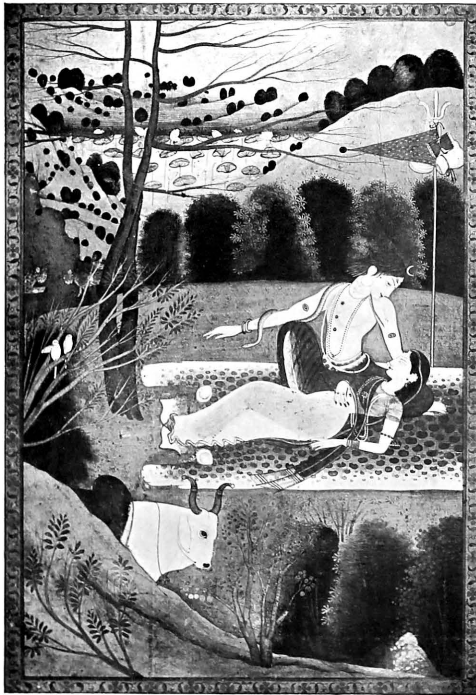
SIVA AND PĀRVATĪ. PAHĀRĪ, ASCRIBED TO MOLA RĀM OF GAHRWĀL (D. 1833). AUTHOR'S COLLECTION