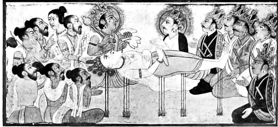
THE DEATH OF BHĪSHMA. EARLY RĀJPUT. AUTHOR'S COLLECTION