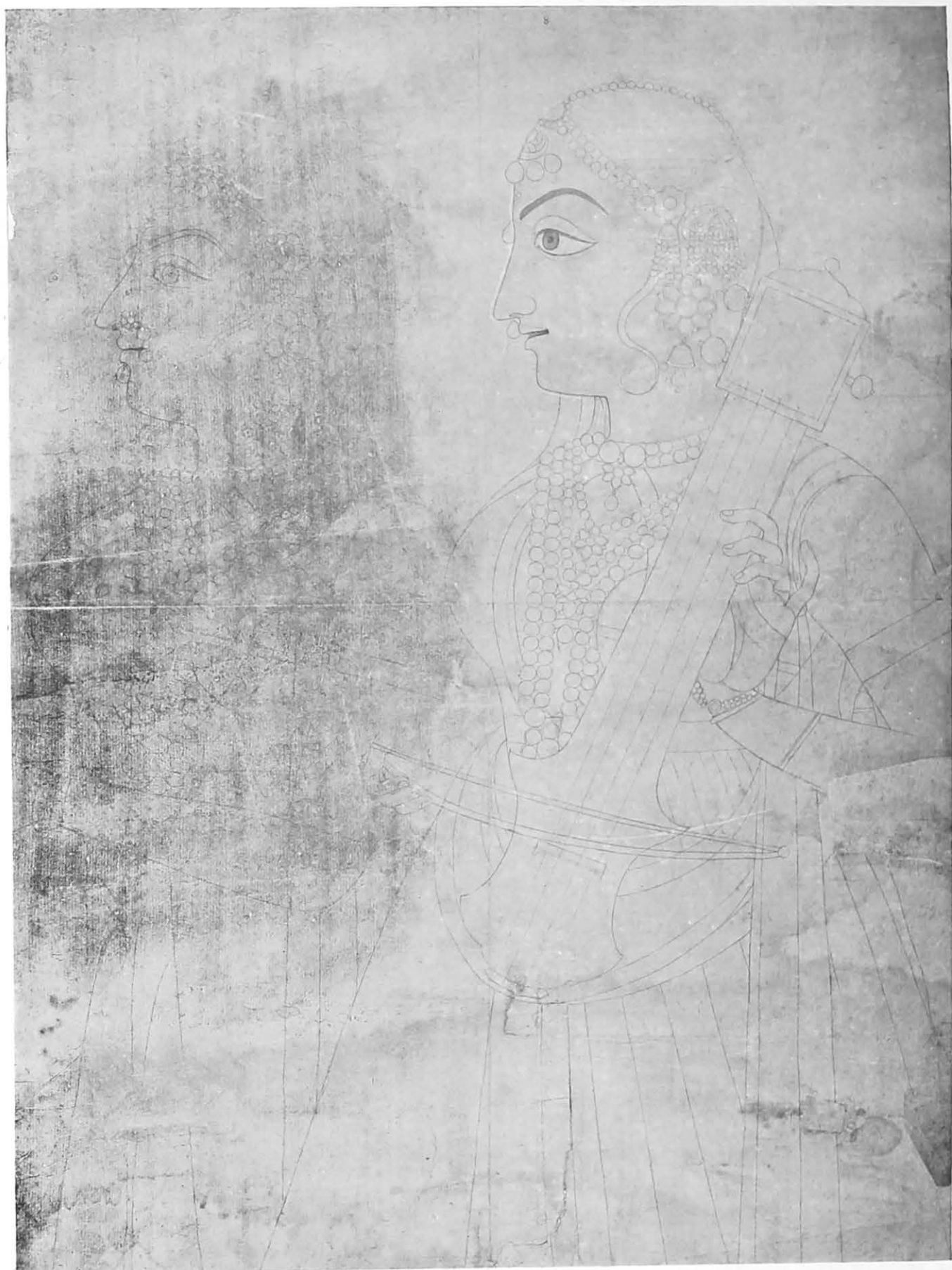
MUSICIANS (ORIGINAL POUNCED TRACING); JAIPUR. AUTHOR'S COLLECTION