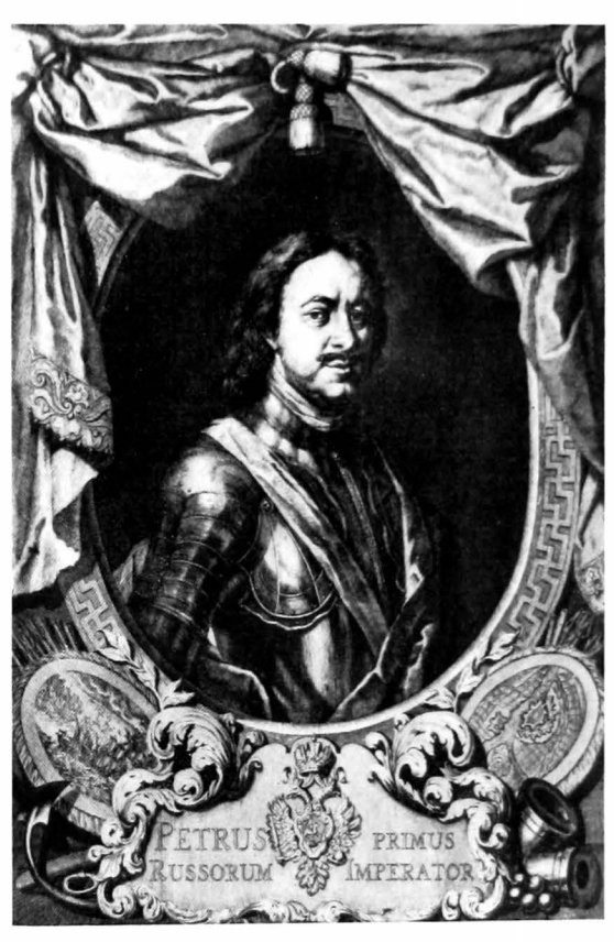
ENGRAVING OF THE PORTRAIT BY KARL MOOR, 1717.