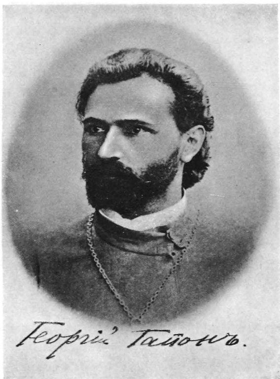
GEORGEY GAPON, WITH AUTOGRAPH.