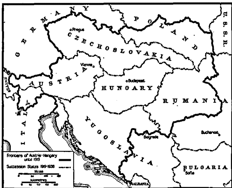
AUSTRIA-HUNGARY AND THE SUCCESSION STATES

For the next twelve years Governments ruled in which the "magnates," or great landed proprietors, held power. In old days the power had lain between the "magnates" (the big landowners) and the "gentry" (the smaller landowners and official class). Both held almost identical, and essentially conservative, views on social questions, their main differences being in their attitude towards the union with Austria, and later to a Habsburg restoration. The magnates were more pro-Austrian, while the gentry rather typified Hungarian separatism. The former issue no longer existed after 1918, and, after two unsuccessful attempts on the part of the ex-king Karl to return in 1921, the distinction between the two groups gradually faded. Count Bethlen, who was Prime Minister from 1921-1931, was chiefly concerned to maintain the status quo in home