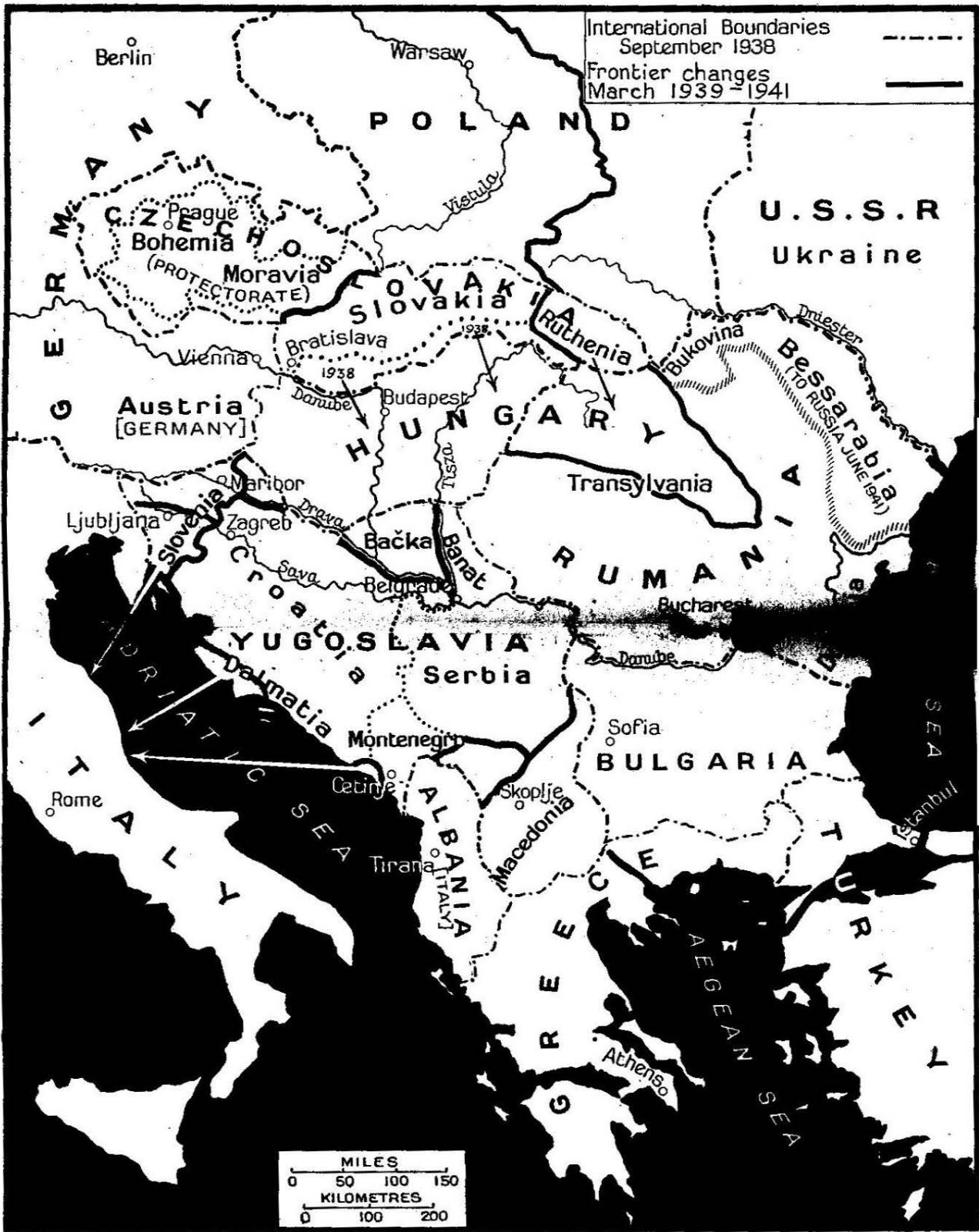
FRONTIER CHANGES IN SOUTH-EASTERN EUROPE, 1939-1941