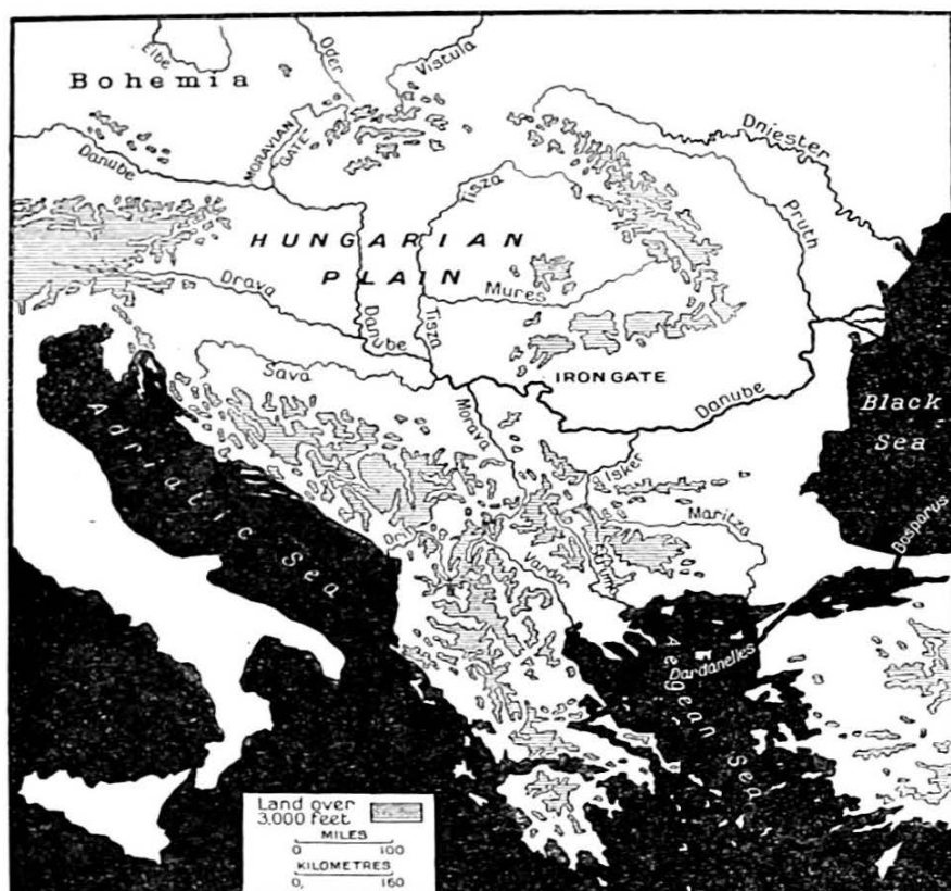
SOUTH-EASTERN EUROPE. PHYSICAL FEATURES

There was, up to 1923, a hope that political agreement might have been reached, even between Bulgaria and Yugoslavia, divided politically by fierce differences over the Macedonian question, and perhaps even some kind of South Slav federal union between the peasant Governments of these countries. The murder of the Bulgarian and Croat peasant leaders in 1923 and 1928 respectively, and the fall of the peasant Governments probably ruled out hope of agreement, and in any case Italian policy had been working in both countries to prevent it, in order to weaken Yugoslavia.