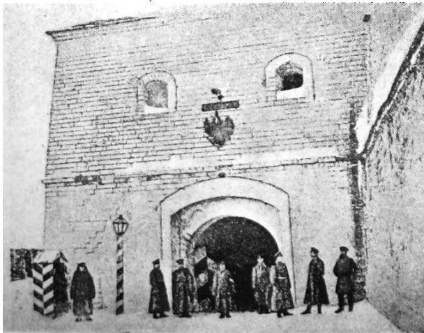
Main Entrance to the Fortress