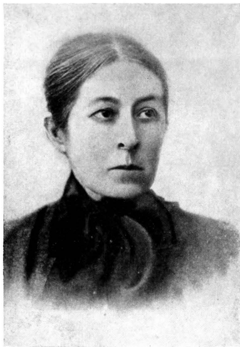
Nizhni-Novgorod, 1906 (after her release)