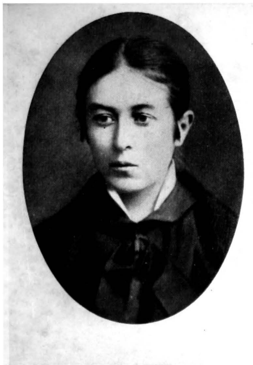
St. Petersburg, 1884 (before entering Schlüsselburg)