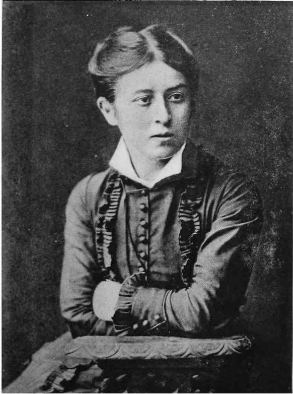
St. Petersburg, 1880