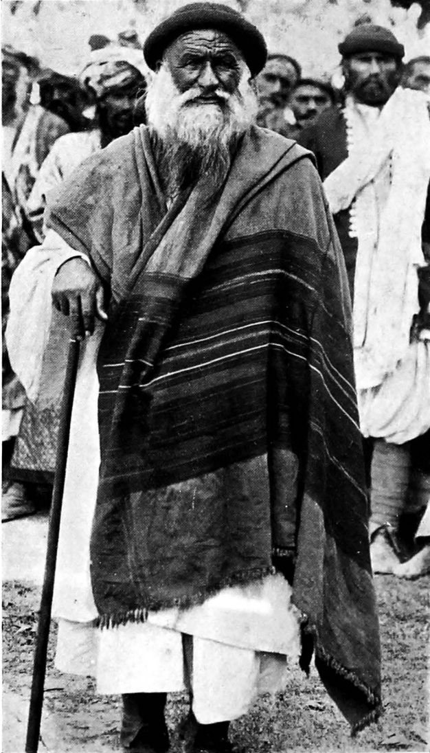
A WAZIRI 'MALIKH' OR HEAD-MAN COMES TO DRAW HIS ALLOWANCE